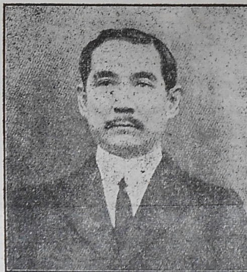
SUN YAT SEN