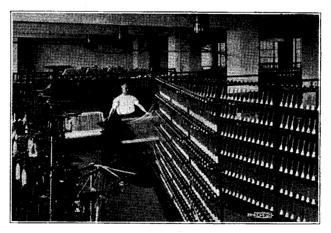
IN A SPINNING MILL All these spindles are operated by a single worker. He receives somewhere around $25.00 a week.

the pay envelope—often as much as twenty or twenty-two per cent reduction. That is, the reduction of pay in relation to the amount of time spent at work. But the reduction of pay in relation to the amount of labor done-that is, in relation to the amount of production—is in many cases more than fifty per cent. The mill superintendents do not speak of the reduction of pay without calling in the same breath for "doubled production per operative." And the proof that they mean to get twice as much production out of each worker. lies in their bland admission that with half the textile workers doing as much work as all did before, they intend to throw on to the street the other half of the mill force.