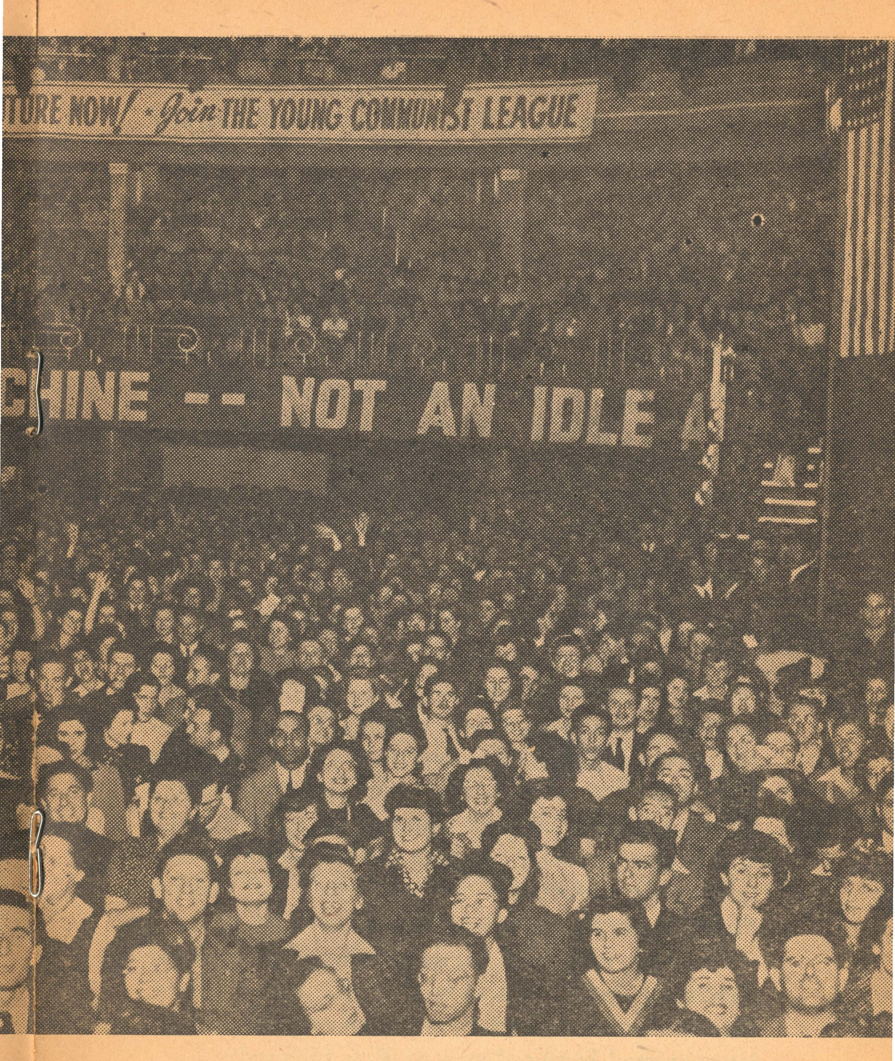
ork City, cheer Earl Browder's call for a Second Front Now.