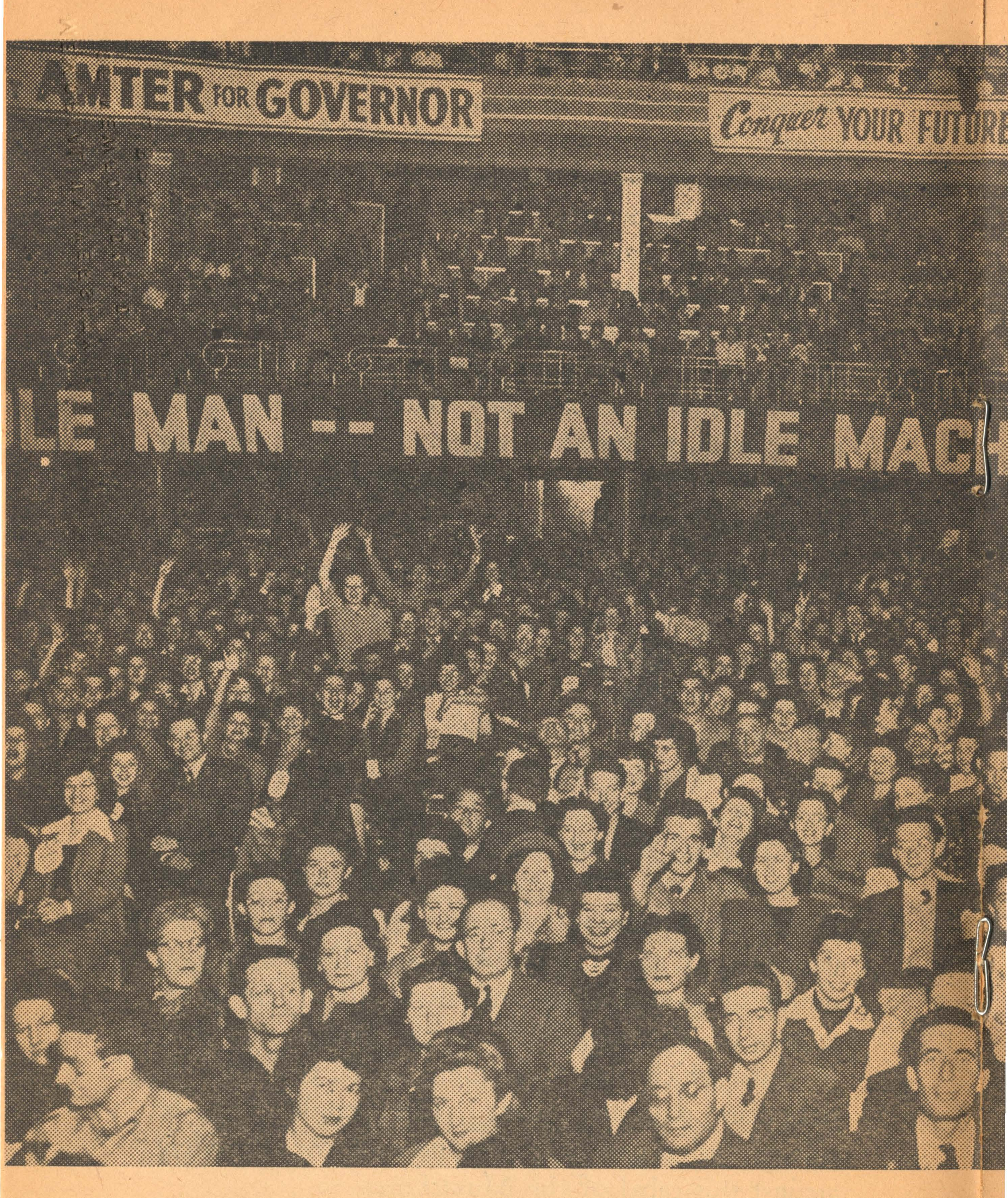
Five thousand youth at Manhattan Center, in New York Ci