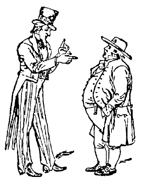
UNCLE SAM & BROTHER JONATHAN