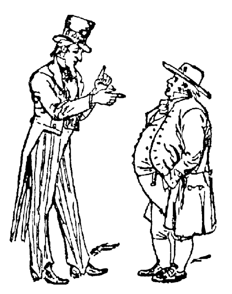
UNCLE SAM & BROTHER JONATHAN