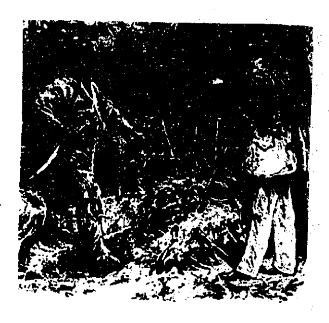
Old engraving depicts discovery of slave revolt leader, Nat Turner, in 1831.