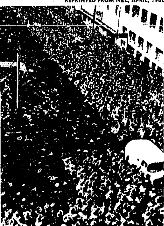
30,000 South African Freedom Fighters before the Capetown police station demanding release of their leaders.

thousands of villages and markets and classrooms all over the globe" as what must concern us: