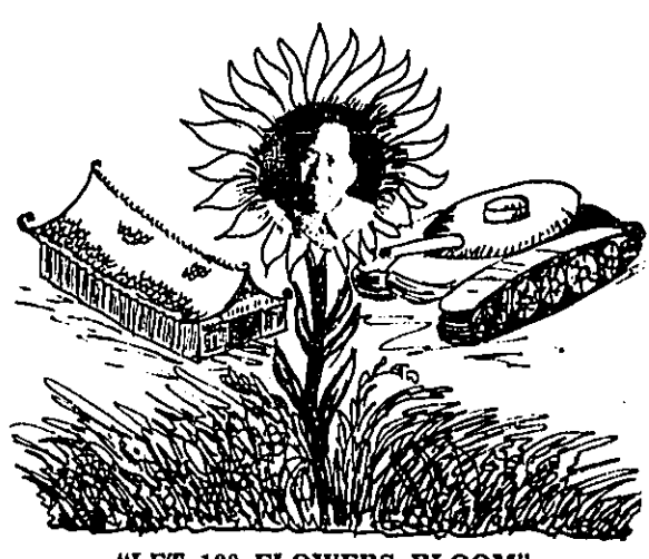
"LET 100 FLOWERS BLOOM"

Nkrumah as the representative of the new, the new, is rather pathetic. There is nothing to add but to say, with Hamlet, 'Alas, poor Yorick, I knew him'." (11)