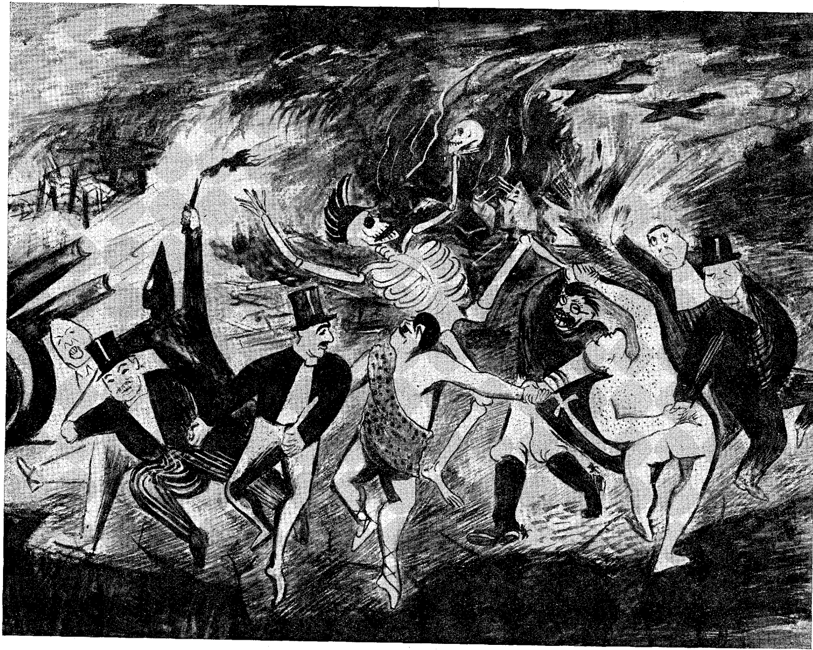
Strength Through Joy