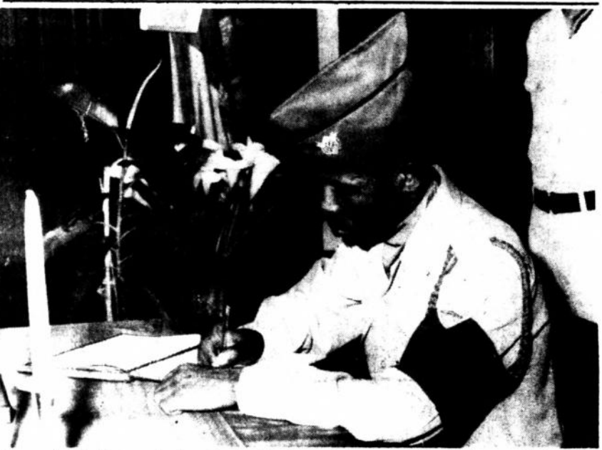
Comrade Chairman signing the book of condolences at the Embassy of the German Democratic Republic here.