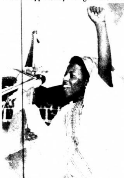
POMOA representative delivering a speech.

revolution oppressed Ethiopian women opia, women farmers have been more