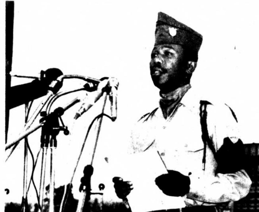
tradition and social mode of imperialism, Comrade Lt. Col. Mengistu Haile-Mariam, PMAC Chairman addressing the capitalism and colonialism - shall be mammoth rally at Revolution Square on the occasion of the celebration of International Women's Day.

ing a huge rally here at Revolution from fraternal socialist countries, the PMAC members, government officials, sentatives of international organizations