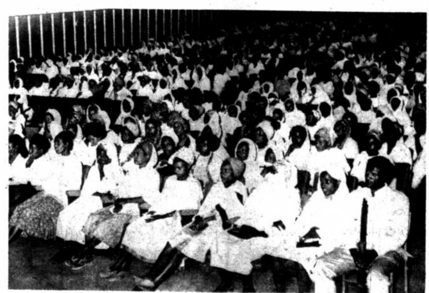
Women being given political education in one of the kebeles here.

The woman judge further noted that it was up to the educated women who are educationally privileged in comparison with the vast majority of the uneducated ones, to assume the responsible role of mobilizing and po-