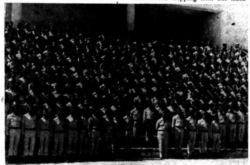
posing for a group picture with the graduating batch and officers of the training centre.

Since expression of our good intentions is like clapping with one hand