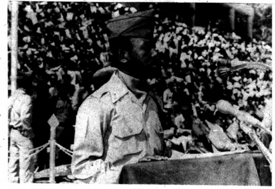
Chairman speaking on the graduation ceremony.

The Second Revolutionary Liberation Army has wrested from the jaws of the treacherous secessionists the stra-