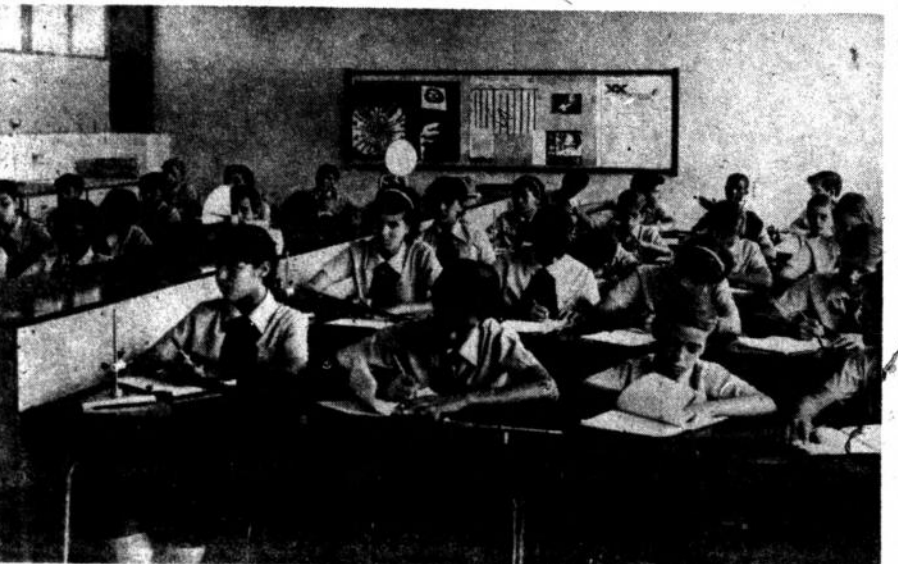
Cuba, the first country in America to be declared a territory free of illiteracy has over the years facilitated the flow of students toward higher studies of professional medium or university character.

But one can also be certain of the other thing: The firm determination of the freedom-loving peoples to defend their independence and uphold their gains. Cuba has graphically proved to the world that the ability to resist and the will for victory are not measured either in the size of a country's territory or the number of its population. Inscribed on the banners of the Cuban Revolution were the proud words "Motherland or Death ! We shall Win !" and the Cuban people kept their word. They have won.