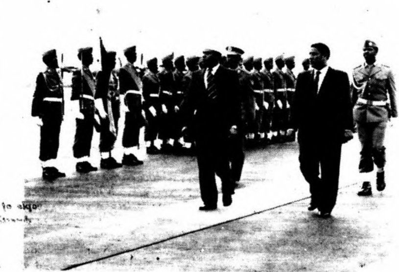
... Prime Minister of Comoros