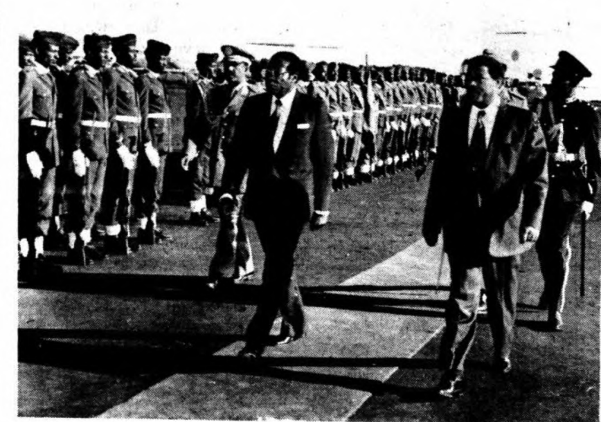
Prime Minister Robert Mugabe of Zimbabwe