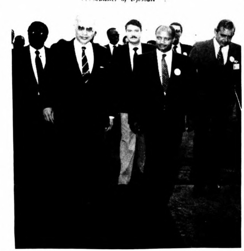
Comrade Goshu Wolde welcoming Foreign Minister of Egypt