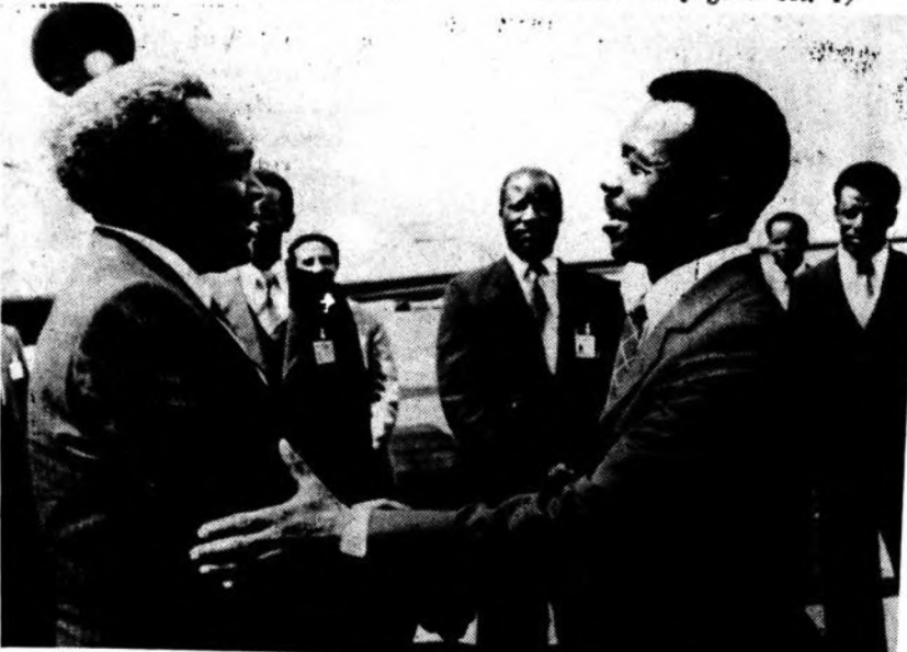
... President Milton Obote of Uganda

The Presidents were accorded military honours. The national anthems of (Contd. on page 9 col. 1)