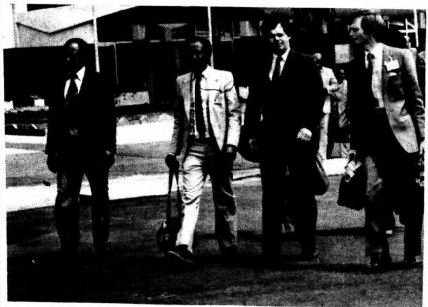
The British delegation on departure at the airport