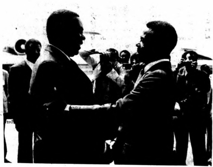
President Andre Kolingho of the Central African Republic