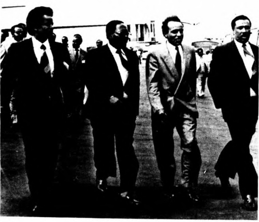
Minister of Djibouti