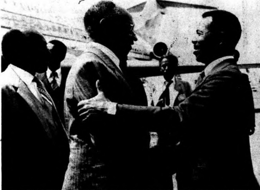
President of Cambia