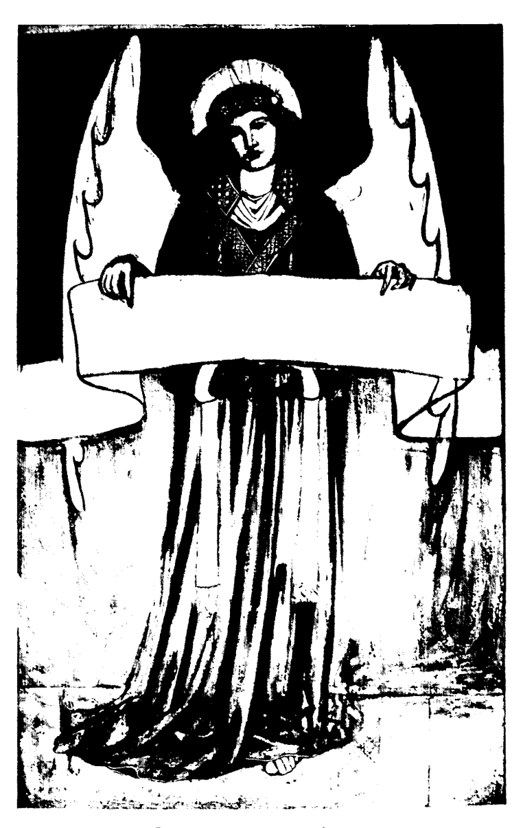
One of a soviessey'. Angols, painted on the nave regiej Josus Cottege Chapet Cambridge, yeen the viginal custoen by William . Morres belonging to the Cottege