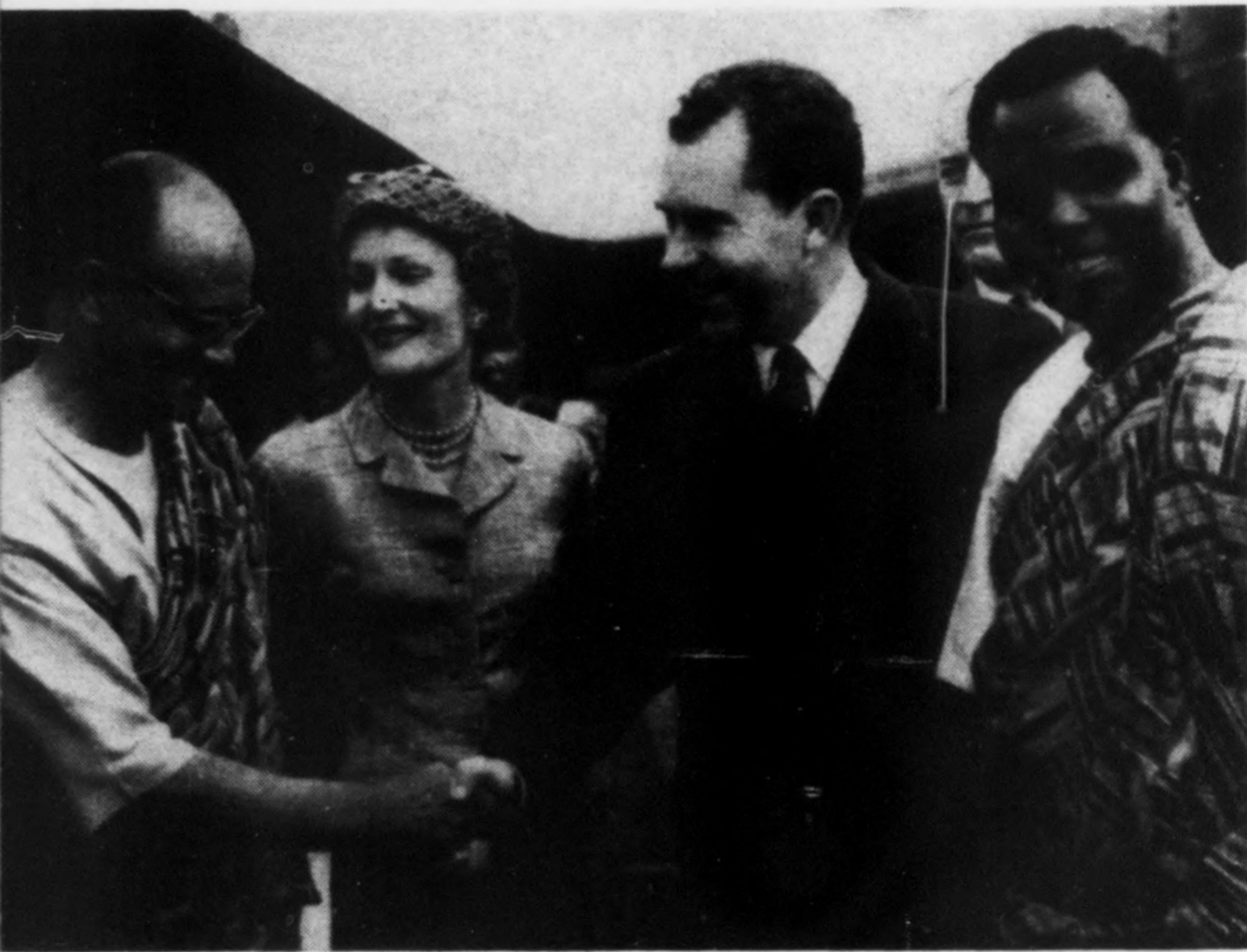
Vice-President Richard Nixon shakes hands with Ghana minister of communications Casely-Hayford (left) as Mrs. Nixon and minister of trade and labor Kojo Botsio (right) look on following the Nixon's arrival at Accra airport.