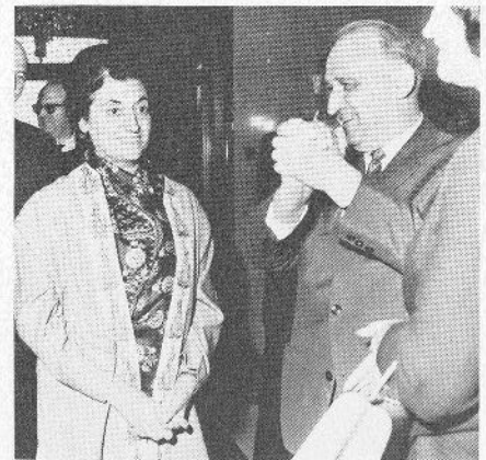
◆ With Indira Gandhi