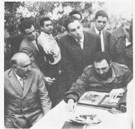
◆ With Fidel Castro