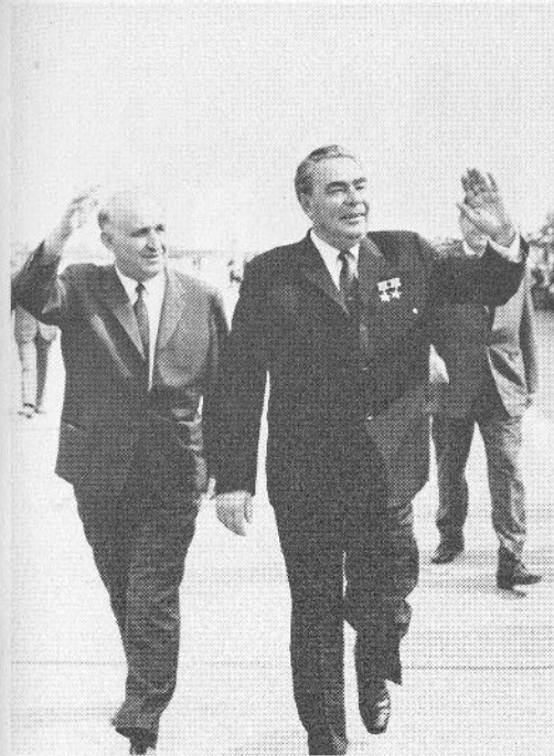
◆ With Leonid I. Brezhnev