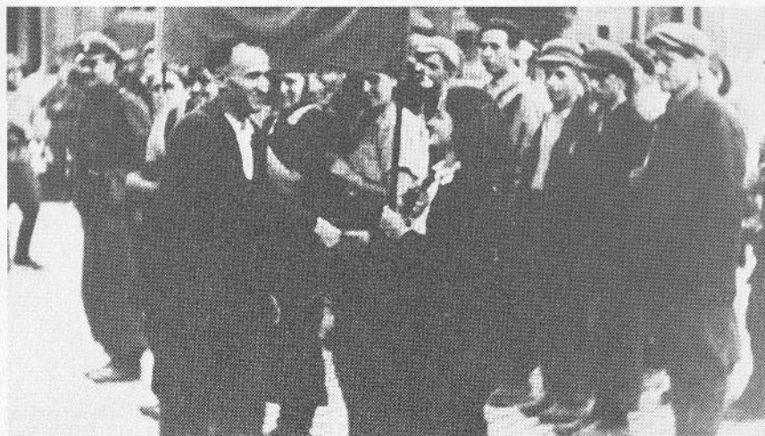
◆ Greeting the Chavdar Partisan Brigade on Victory Day, September 9, 1944