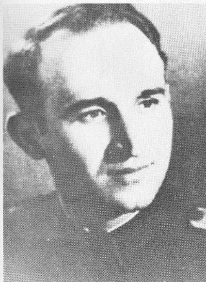
◆ Todor Zhivkov, 1944 as a member of the People's Militia General Staff