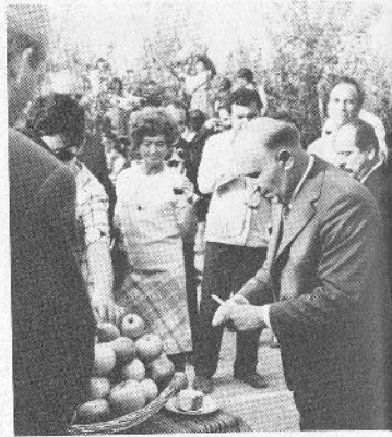
◆ At an agricultural exhibit