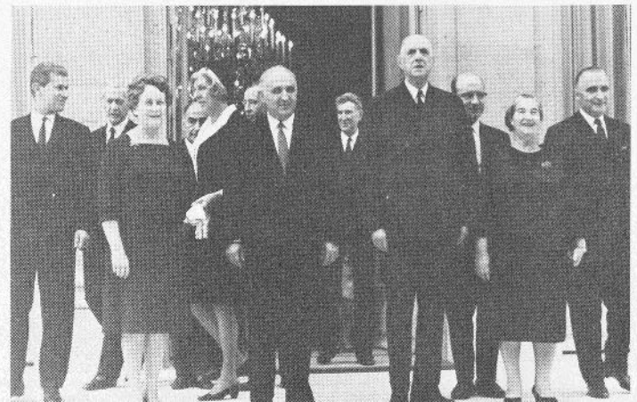
◆ With Charles De Gaulle