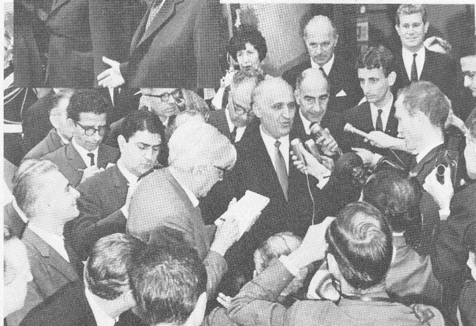
◆ At a Paris interview with French and Bulgarian journalists