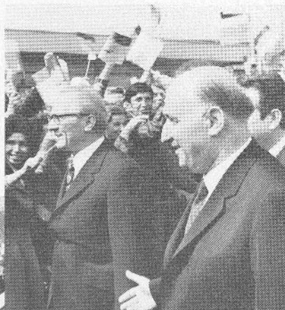
◆ With Erich Honecker, First Secretary of the Socialist Unity Party (SED), German Democratic Republic