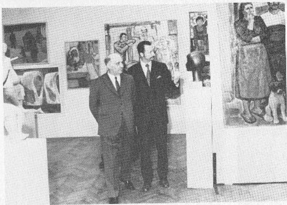
◆ At an exhibit of the Union of Bulgarian Artists