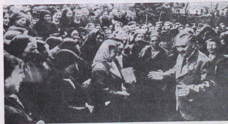
Dimitrov addresses bereaved partisan families, Sofia, May 6, 1947

Educated by Dimitrov in a spirit of loyalty to Marxism-Leninism and proletarian internationalism, in a spirit of revolutionary irreconcilability and perseverance in achieving its goals, the Bulgarian Communist Party continued the