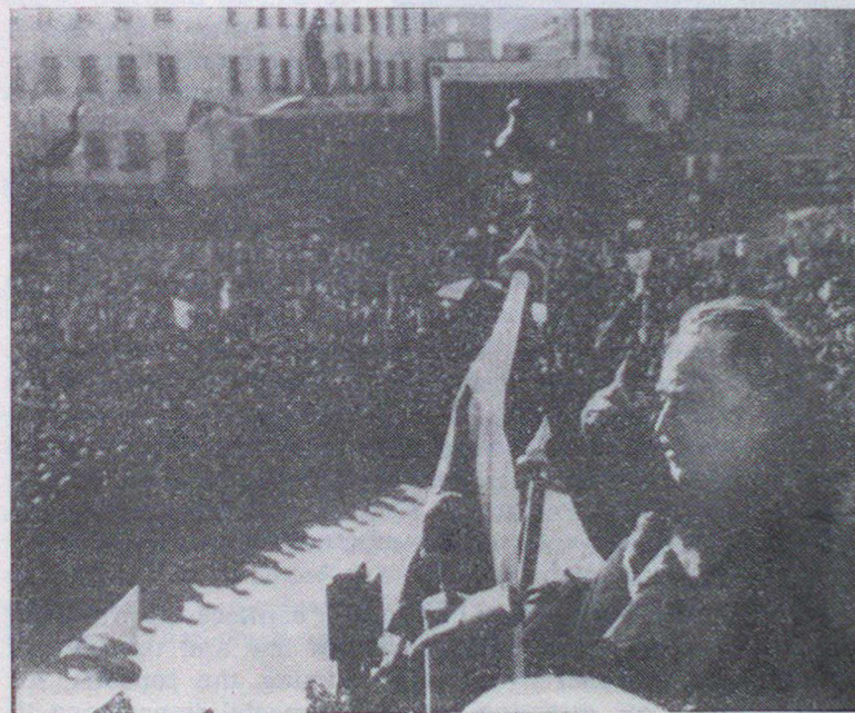
Dimitrov speaking at mass meeting following conclusion of treaty between People's Republic of Bulgaria and Soviet Union, Sofia, March 24, 1948

But Dimitrov warned that the bourgeoisie, still in control of the country's economy, would try to regain its lost positions. He advised the Fatherland Front, made up of divergent