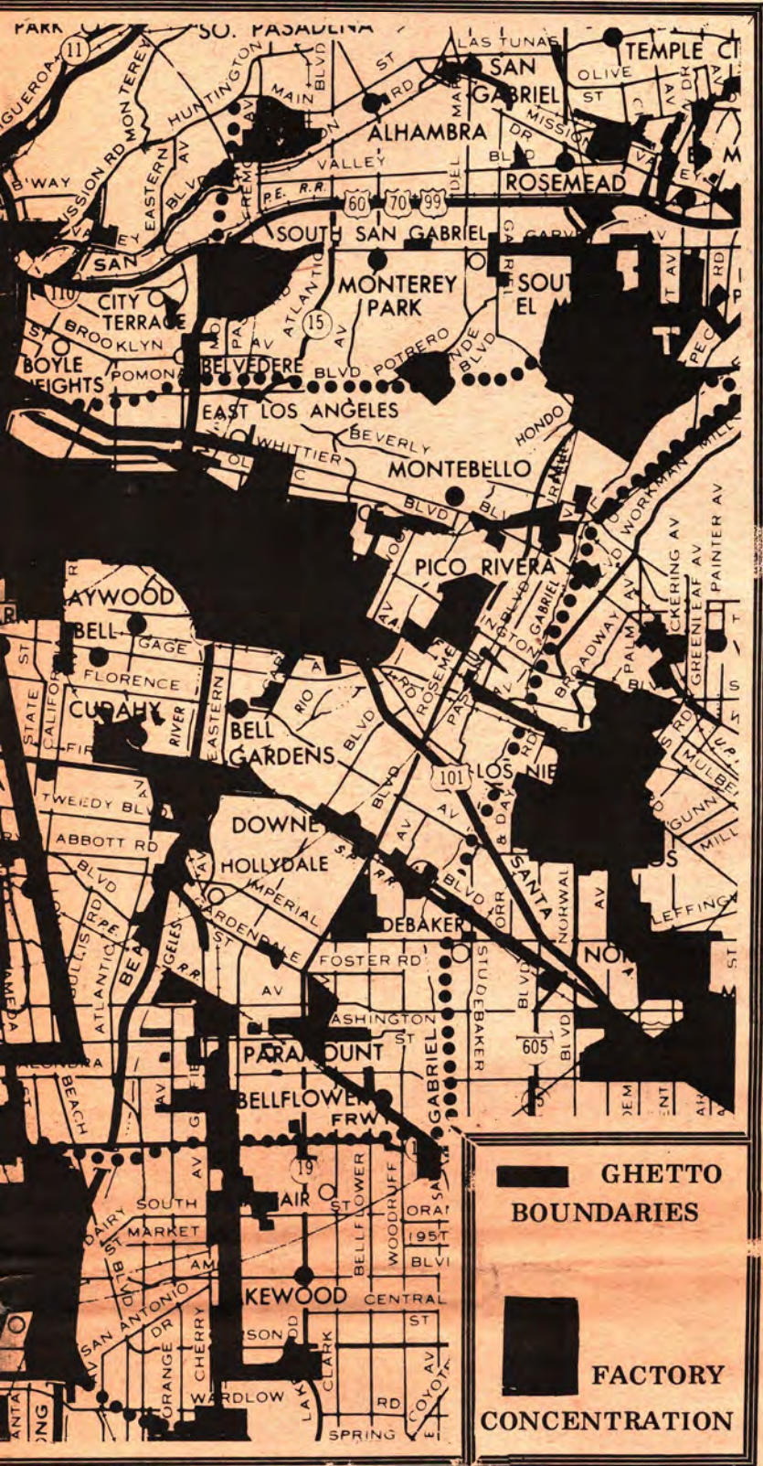
factory concentration and South L. A. ghetto boundaries.

factory worker living dows is unemployed. here is an 80 per cent ghetto industries hire a workers. alism's plea? What is ts with their phony re- ? Can they claim that South L.A. was an in- y say that they did not kers were given ghetto- ion to their percentage n, that there would be ng black ghetto work- aware of this fact, but ing possible to conceal Map, published by the al Estate Assn., can be L.A. Chamber of Com- (L.A.). The map shows complex in the north- ghetto. e southwestern corner, der there is still another also shows the indus- oughout the entire ghet-