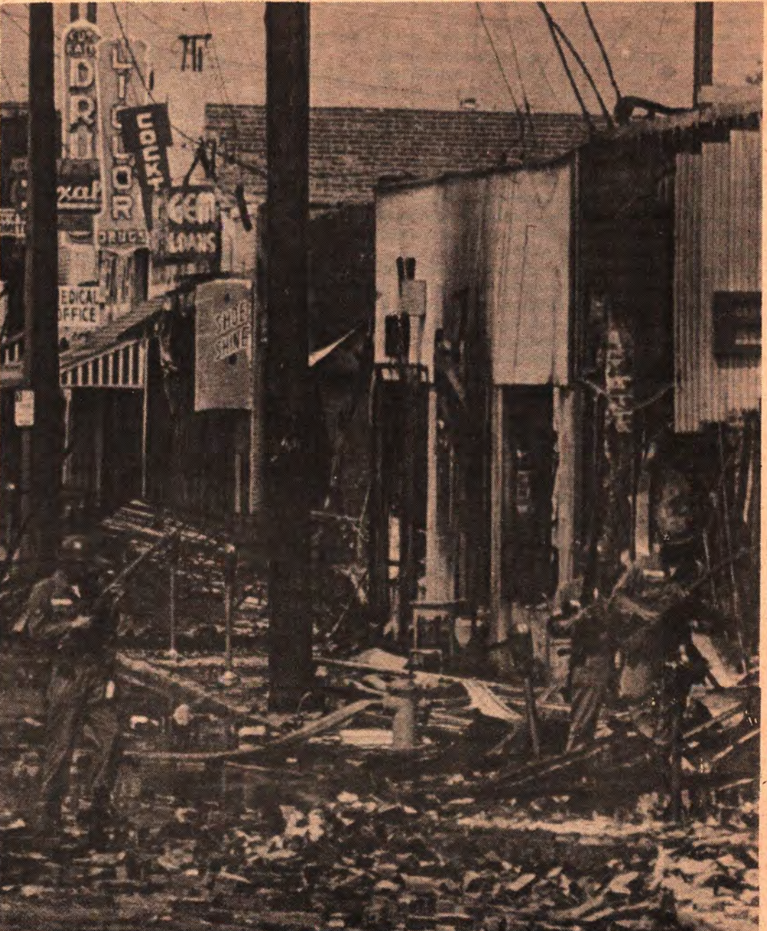
TAKEN FROM THE MINOR ENEMY

The black people of South L.A. possess a weapon more powerful than twenty-two thousand guns! And black people can choose their own time and places of battle!