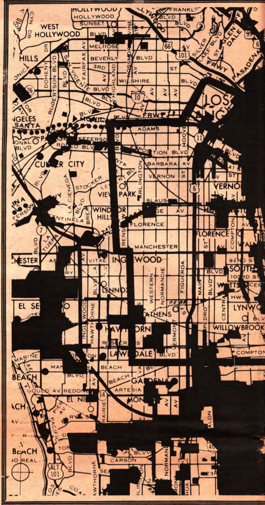
A portion of the Industrial Zone Map, showing fa

The $40 million in property damage from the August Rebellion is a drop in the bucket compared to the millions stolen by these cor-