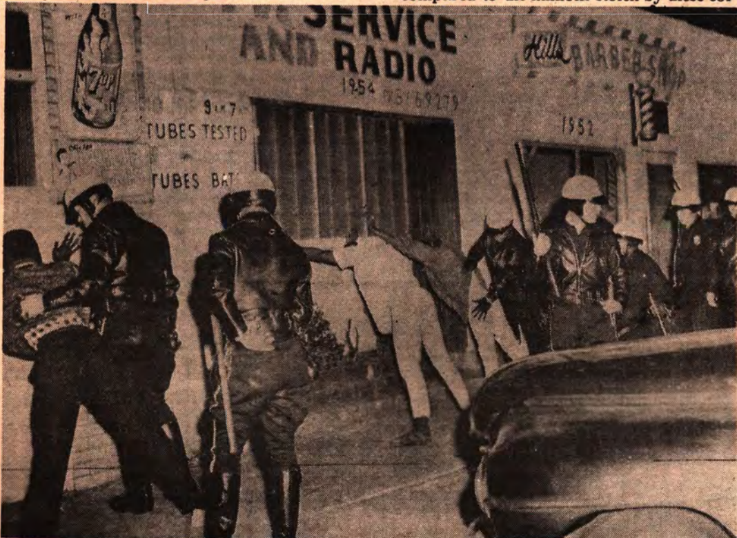
MARCH 16, 1966: THE REVOLT GOES ON

At the General Motors plant on the western