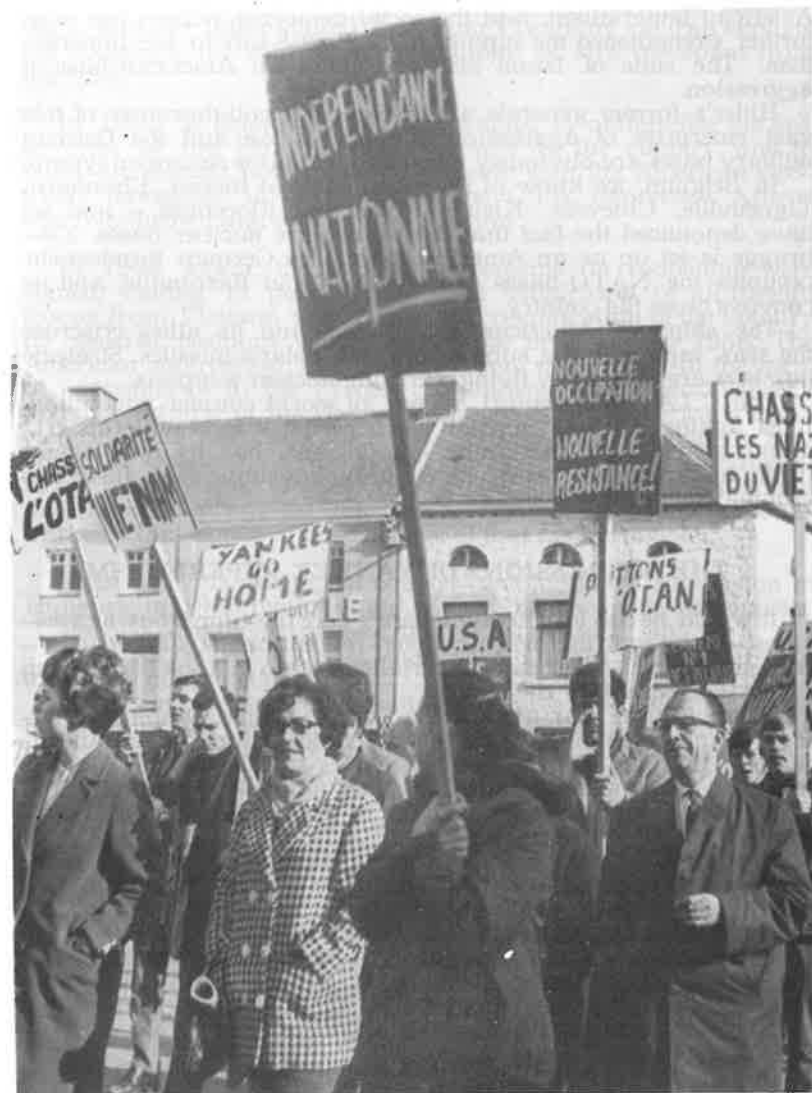
Demonstration against the American nuclear base of Florennes in October 1965.

To these bases must be added those of the countries of the American-led military pacts, NATO and SEATO. Thus, the bases of British imperialism, in particular, from Gibraltar to Singapore, from Cyprus to Ascension Island, are placed at the disposal of