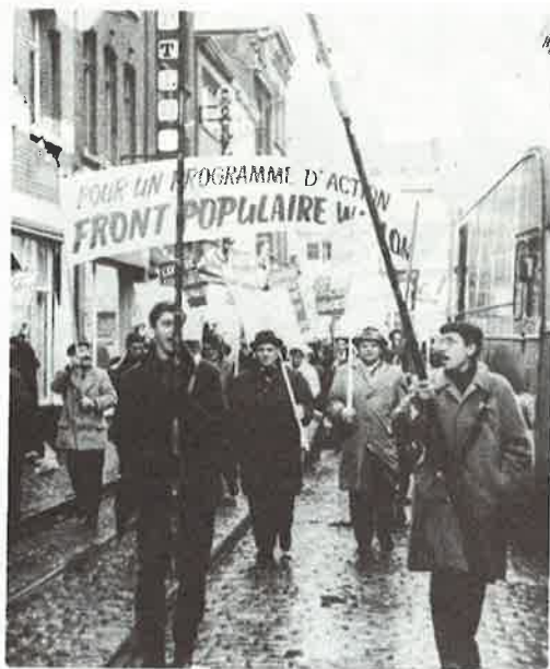
The People's United Front lays out the objective of work demands, the national and democratic objectives of the peoples of Belgium - A demonstration of the Wallon People's Front.

masses, must be prepared for this eventuality. For that, there must be a vanguard party, a revolutionary party, a Marxist-NINIST PARTY.