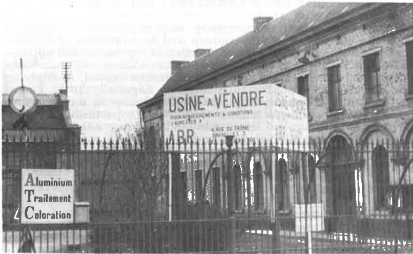
The control, the takeover of the economic of Belgium, the political, economic and military control of the country, carried out either directly by American imperialism or through the intermediary of its «European» instruments - the European Common Market and the European Coal and Steel Community - bring about the closing of firms, firings, unemployment, the ruin of numerous regions.

Let us recall that the subsidiaries of the American companies absorb 25% of the exports of the USA, that American shipping is often imposed in the transactions with the American firms. Here is yet another area in which the Yankee diktat pays off