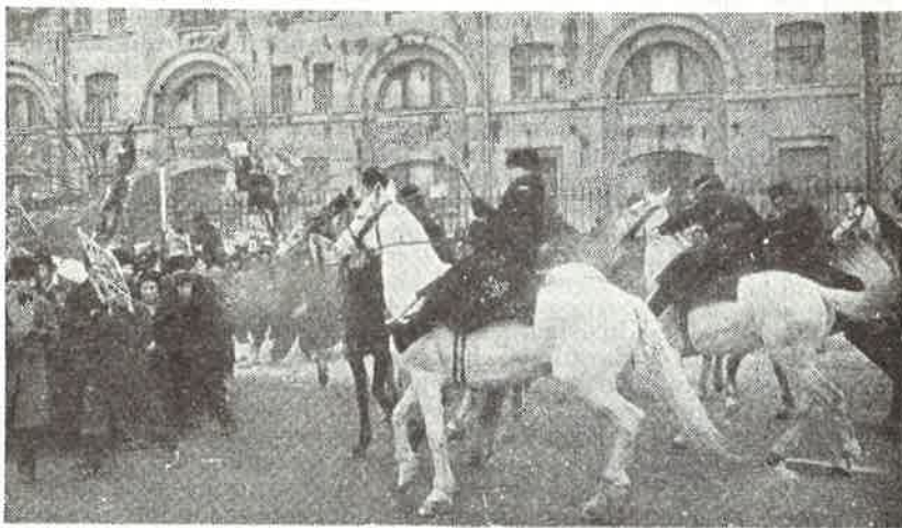
Brutal police repression by the Khrushchevite revisionists against a demonstration of youths in Leningrad, against the Yankee-Nazi aggression in Vietnam.

They have particularly distinguished themselves in the anti-