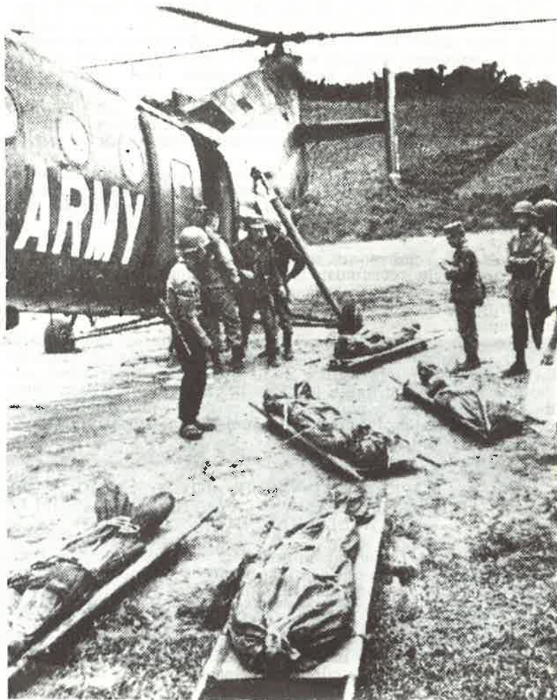
In Vietnam, the Yankee-nazi aggressors are suffering defeat after defeat.

The experimental tests of the Chinese atomic bomb have destroyed the Americano-revisionist nuclear monopoly and delive-