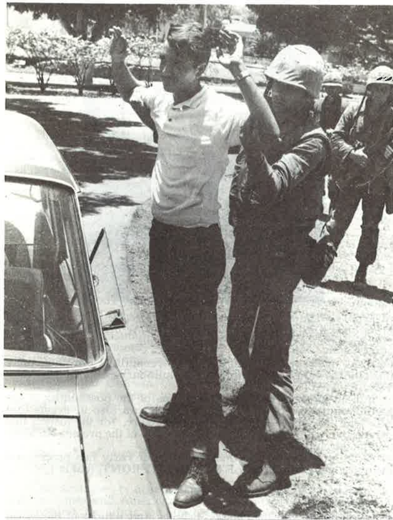
American aggression in San Domingo.

We cannot foresee, at present, in which concrete conditions, following which precise events will be created in Belgium the revolutionary situation that will permit the destruction of the bourgeois state machine and installation of the power of the dictatorship of the proletariat. What we know with an absolute certainty is that this revolutionary situation will inescapably be produced again : capitalism produces itself the objective conditions that will permit the workers to bring it down. It provokes periodically its own bankruptcy. But in order that the revolutionary situation leads to a revolutionary victory, the working class, the labouring