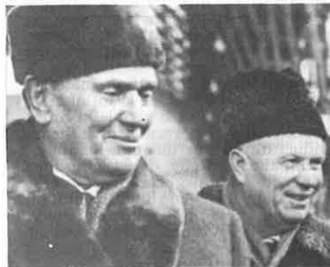
Tito, lackey of American imperialism, «ideologue» of modern revisionism, plots with Khrushchev, at that time leader of the Americano-revisionist cooperation for world domination against the peoples. The successors of Khrushchev continue his policy with greater ruse and hypocrisy.

In collusion with American imperialism, the Khrushchevite