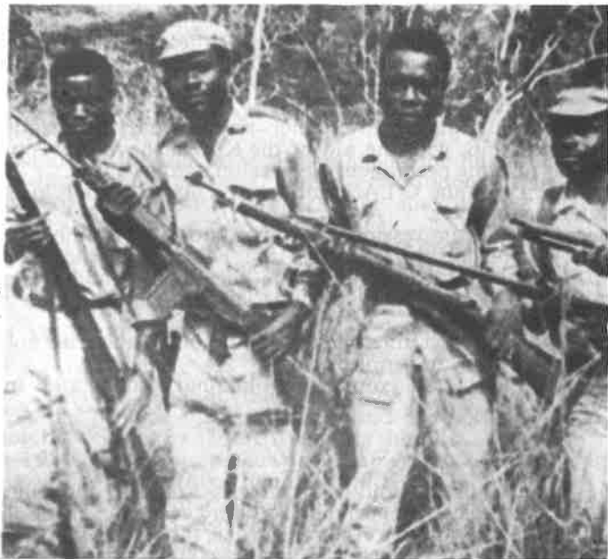
The Congolese peoples have taken up arms to drive out old and new colonialists.

Still under the banner of the U.N., there was the arrest and assassination of Lumumba, the American ambassador having