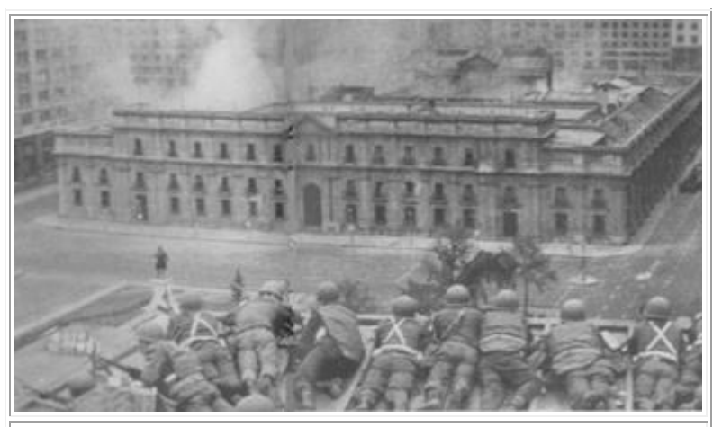
September 11, 1973: Soldiers shoot at the Moneda, the government palace

So it was not only Allende, but also the leaders of the CP of Chile, who blindly trusted in the instrument of power of the bourgeoisie. They continued spreading this illusion, this erroneous evaluation of the armed forces, despite the imminent threat of civil war. A captive of the disastrous policy of the "peaceful road to socialism," the Chilean revisionist G. Banchero wrote in the revisionist journal Problems of Peace and Socialism: