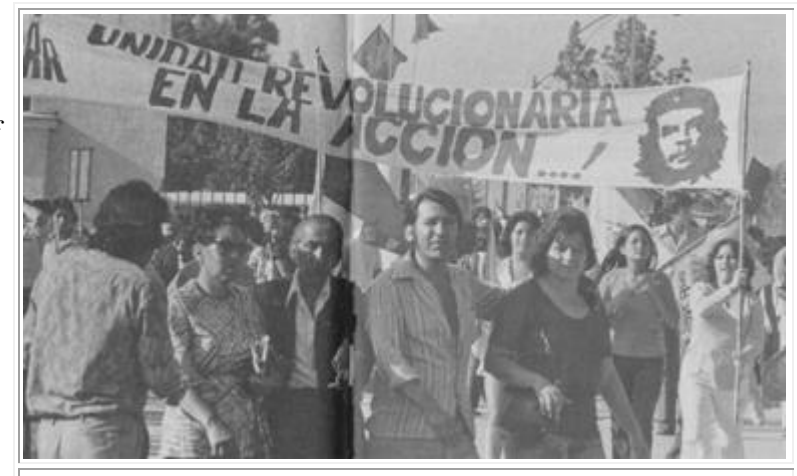
A broad united front

"At the illegal 10th Party Congress (1956) we carefully and self-critically studied the records of the 20th Congress of the CPSU and set ourselves as an immediate political perspective the task of establishing closer links with the masses and steadily carrying forward the revolution. 'Our country,' said Party General Secretary Galo Gonzalez, 'gives examples suggesting the possibility of