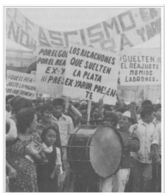
The working class demands: Don't give the fascists an inch!

imperialist and anti-oligarchic revolution in order to begin the march to socialism without civil war, although naturally by means of a very harsh class struggle."