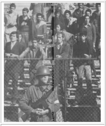
The military turns the National Stadium into a concentration camp, and carries out a blood bath

and mutual respect have evolved between the army and the working class (listen clearly – RW editor's note) in the name of the patriotic goal of shaping Chile into a free, advanced, and democratic land." (August 1973, p. 21; English edition.)