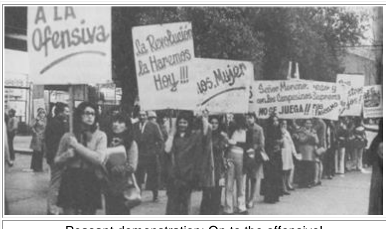
Peasant demonstration: On to the offensive!