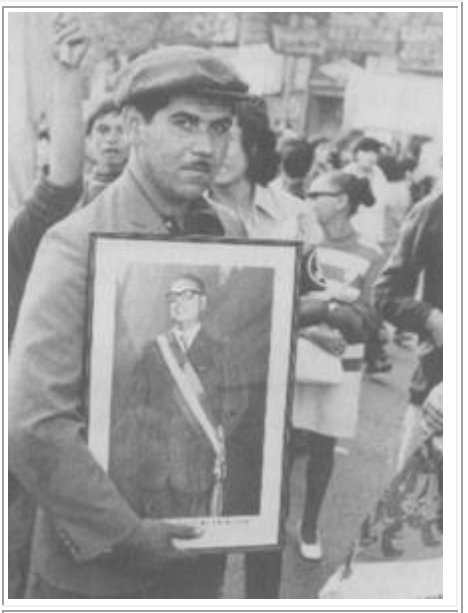
"We have always expressed – and we repeat today despite the recent events – that in the current situation in Chile there is a real option of carrying through the anti-

This is a pious wish, it is bourgeois pacifism that was spread especially during and after World War I under the slogan: Never again war! in order to divert the workers from the revolutionary struggle. Although reaction was already placing on the agenda the armed struggle against Popular Unity and the Allende government, Corvalan begged his party members: