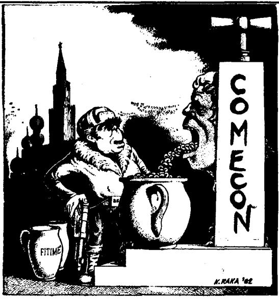
From 'Drita' -- PSRA.

Although the superpowers have a great economic and military potential and try to pose as if they are invincible, reality shows the opposite. The history of the latest decades provides numerous examples of the triumph of the peoples in their just