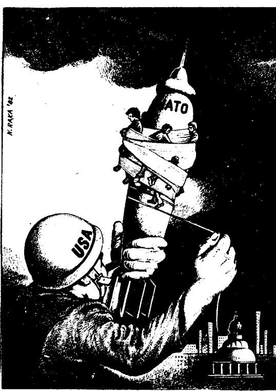
From 'Drita' - PSRA

An explosive situation is created now in all of the Persian Gulf zone. The USA and the Soviet Union are ching up successive intwes against the brave and ,≥aadom-lovina Iranian eorle. The Soviet social imperialists launched an open aggression against Afghanistan and continue to maintain occupation of it. In the South Atlantic, British imperialism, which does not want to give up its old colonial policy, and backed by US imperialism, adopted the gun-boat policy and that of blockade against the people of Argent-