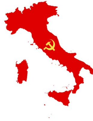
"Communist Italy" by Nick.mon - Own work. Licensed under CC BY-SA 3.0 via Commons -

A hundred flowers seemed too have bloomed on the Italian ML scene in the 1960s. The traditional regionalism of Italian politics was mirrored in the fragmented nature of radicalism in Italy, and was no less true of the anti-revisionist experience. The early emergence of a self-declared Italian Communist Party (Marxist-Leninist) did little to unify the movement in which it seemed every city had its own group develop.