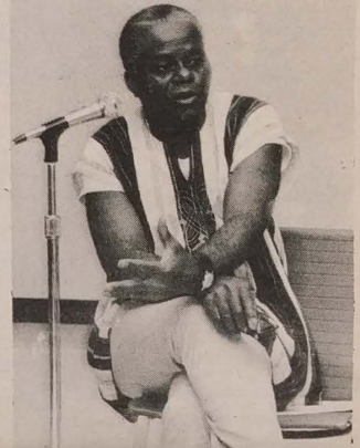
Dr. John Henrik Clark discussing the historical contribution of Afrikan women at the Afrikan Women's Conference.

In the Health, Welfare and Employment Workshop discussion centered around coming to the understanding that protracted struggles to minimize the exploitation and dehumanization of people in today's institutions are necessary only to heighten the consciousness of the people and thereby constantly intensify the total struggle for world socialist revolution. For most brothers and sisters this very basic political education