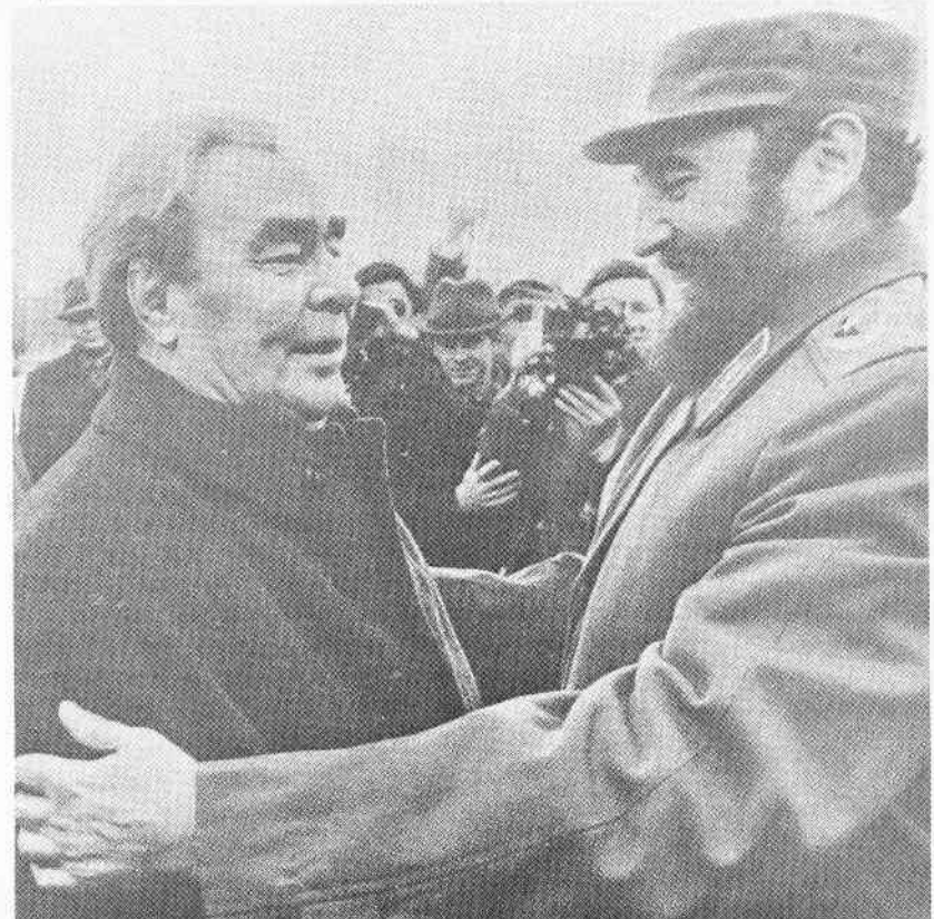
Not content to rest on his Angola laurels, Castro went on an African tour in early 1977, visiting eight countries. At the same time, with a slightly different itinerary, Soviet President Podgorny also took an African safari. Together, the two attempted to pervert the African liberation struggles for the benefit of social-imperialism. When Castro arrived in Moscow to file his report Soviet boss Brezhnev embraced and congratulated him.

For the Soviets, Cuba is a long-term investment with far greater profits expected than simply immediate economic benefit. It is even conceivable that the USSR could lose money, in the short run, on its investments. But this would not affect Cuba's colonial dependence on the Soviet Union. Imperialist powers often subordinate their immediate profit in any particular country to their overall policies. A good example of this is Israel, where the U.S. has poured in billions of dollars, more than it could ever hope to squeeze out of control of the Israeli economy alone. Israel's real value to the U.S. is primarily as a political and military tool with which to protect its vast holdings in the Middle East.