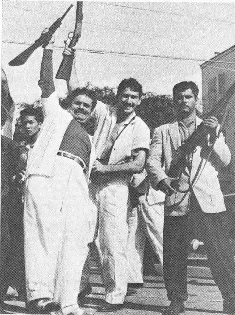
Cuban prisoners freed from Batista's jails on Jan. 1, 1959 as troops of the July 26th Movement marched into Havana. The masses of Cuban people enthusiastically hailed the revolution that swept the U.S. imperialists and their agents from the island and wanted to tear down the old social order. Instead, the Cuban leadership has ended up maintaining the old class relationships, in a new form, while proclaiming that socialism is being built.

The existing U.S. puppet government was overthrown, but it was soon replaced by an army coup led by Fulgencio Batista. Al-