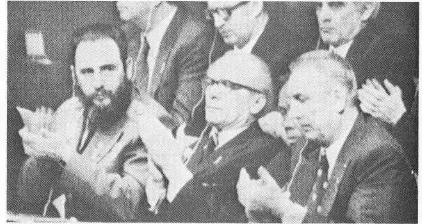
Fidel Castro, along with revisionist leaders Edward Gierek, Poland, and Erich Honecker, East Germany, applaud the Soviet Union’s Brezhnev during his speech to the 1975 Soviet party congress. The Soviets have found it useful to trot Castro around the world on various occasions, hoping to use his “revolutionary” image to cover the Soviet Union’s imperialist maneuvers. Castro received honors at the meeting, including “prolonged applause,” for his services in Angola.

congress. Not only should the Cuban leadership have been “humbler” regarding Soviet foreign policy, they also should have been “applying correctly the main useful experiences in the sphere of economic management” in the Soviet Union.