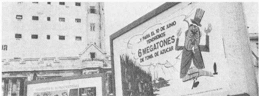
Billboard exhorts Cubans to achieve the goal of six million tons of sugar by June 10, promising it would be a blow to Uncle Sam. Castro staked the "honor of the revolution" and, more importantly, most of Cuba's resources on the success of the 1970 10 million tons campaign. Its failure left the economy in shambles and the country further in hock to the USSR.

to the instructions of a Harvard economist. 18 Since these methods arranged things for maximum "efficiency" as measured in pesos and centavos, they were simply a disguised form of running things according to profit (and in fact are often used by capitalist management in the U.S. and USSR). By the early 1970s, however, even these methods turned out to be not efficient enough and piece by piece the government began reorganizing the economy according to the same principle, in form as well as content, followed by the dollar and especially the ruble.