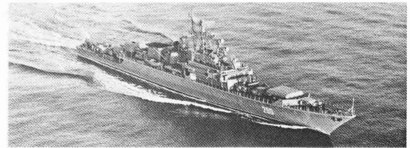
Soviet warships and submarines call regularly in Cuba where the Soviets maintain their only secure naval facilities in the Western Hemisphere. Using Cuba as a naval base in the Caribbean Sea has long been a practice of the U.S. imperialists, who still “own” and maintain a peice of Cuban territory, the Guantanamo base, as the headquarters of the U.S. Caribbean Fleet.

goal, communism and classless society, is not just a matter of abundance. But that is exactly how Castro explained it to the masses, as if communism were just a pie in the sky promise of better times. For its own liberation, the working class has to lead the masses of people in transforming conditions in each country, wiping out the material and social basis of class contradictions and training the masses in the outlook of the proletariat, so that everyone becomes a worker and the workers are conscious masters of production and every aspect of society. Only on that basis will classes disappear and communism be won.