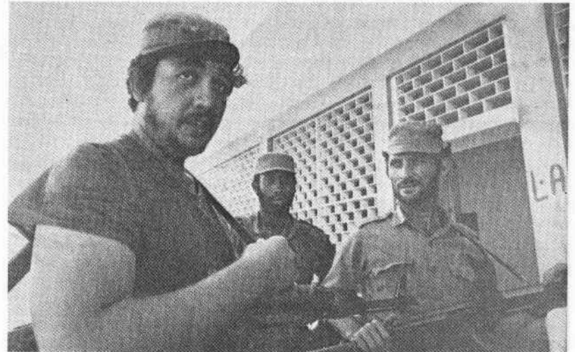
Cuban soldiers after their capture of Ambriz in northern Angola. Over 12,000 Cuban troops under Soviet "advisors" served as an expeditionary force to conquer Angola for the social-imperialists, all under the guise of fighting imperialism.

"Had we been humbler, had we not had excessive self-esteem," Castro explained, "we would have been able to understand that revolutionary theory was not sufficiently developed in our country and that we actually lacked profound economists and scientists of Marxism to make really significant contributions to the theory and practice of building socialism . . ." (Castro's speeches and oth-