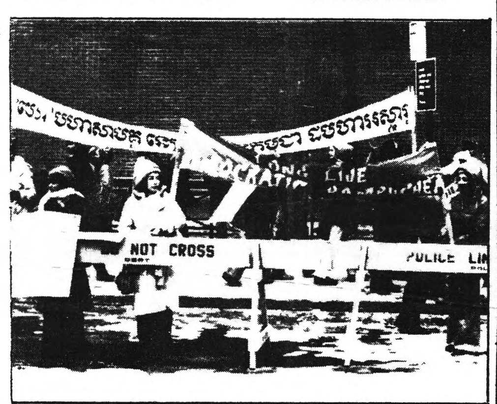
The Kampuchean people surely deserve the American people's support Demostra tions like the above, supporting their just struggle are needed as well as the gathering of material aid to relieve the hunger and starvation brought on by the Vietanamese