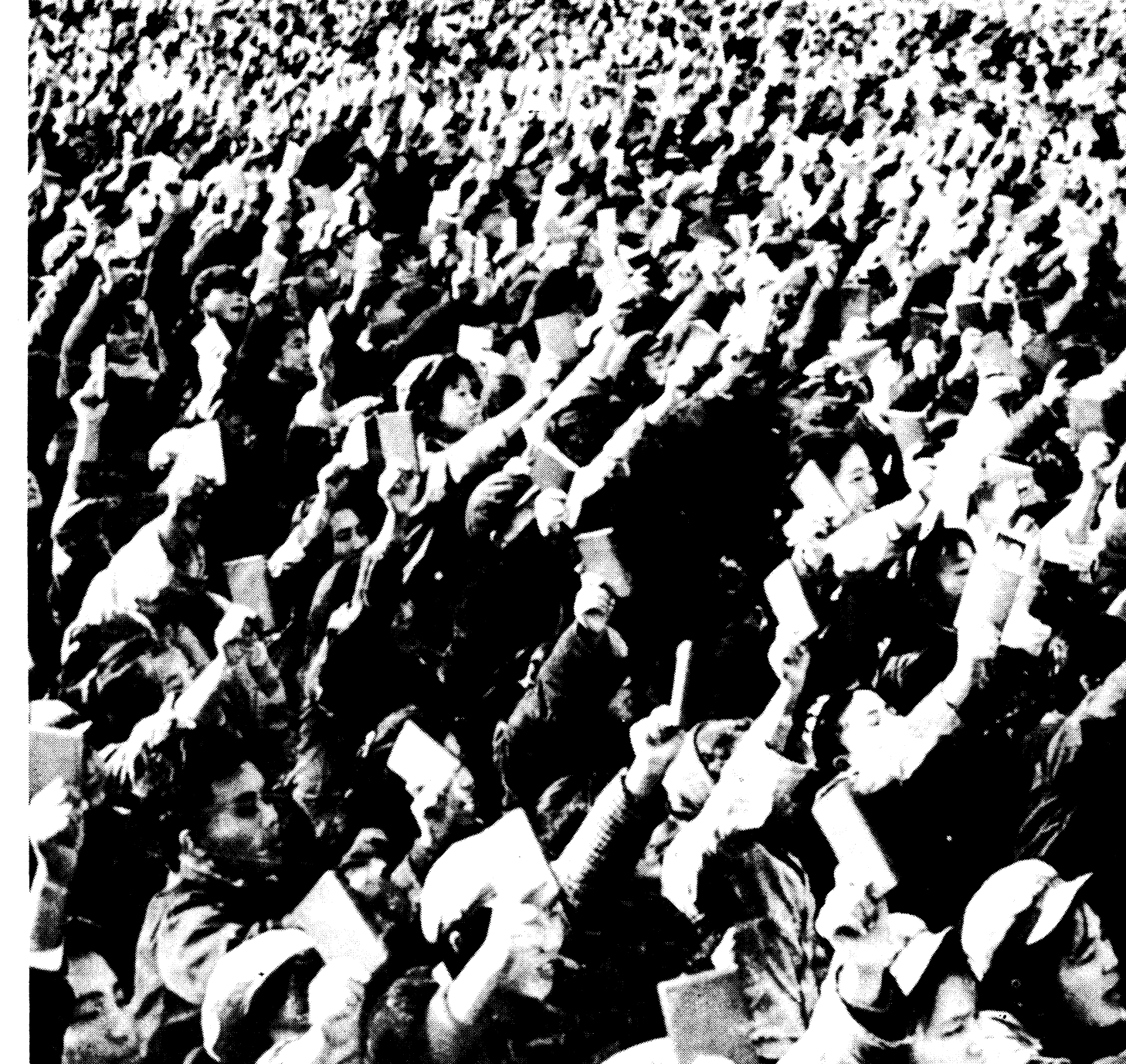
Demonstrators wave Mao's 'little red book' during Cultural Revolution. RCP split after Mao's successors began reversing many policies initiated during Cultural Revolution and downplaying Mao cult.

But if the CP(ML) remained true to Mao's foreign policy, which was not