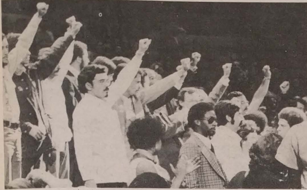
A crowd of over 16,000 people gathered at Puerto Rican Solidarity Day to demonstrate against the imperialist rape of the island and people of Puerto Rico, as well as all oppressed people around the world!