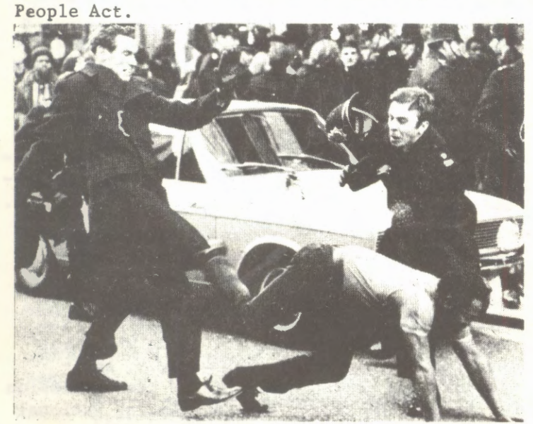
FIGHT STATE RACISM - ARTICLE PAGE 2

The London Waltham Forest "Guardian" recently reported a National Front election meeting heavily guarded by police at Walthamstow Girls High School. The meeting, which was claimed to be public, was allowed in the school despite a Council ban on racist groups hiring schools and halls. The ban was over-ruled on the grounds that it contravenes the Representation of the