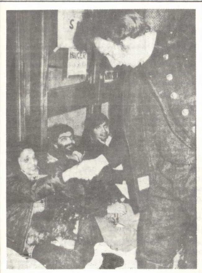
Firemen greeted Grunwick pickets on hunger strike outside the TUC in December; both groups of workers demanded mass support for their struggles: both were sold out by the TUC: but both will learn the lessons of these setbacks and be strengthened in future struggles.

For eight long bitter weeks the firemen spearheaded the struggle against the Labour government. On strike for the first time, their tactics - active involvement throughout the strike on the picket lines, winning and keeping the widest public sympathy without putting themselves forward as a "special case" - can be learnt from by all workers. They've won a promise of the same earnings as skilled industrial workers in two years time, but the fight for better wages now has been lost. Nevertheless the Fire Brigades Union won't be the same again. "The treatment we have received in the past weeks has turned us into a militant union", the Humberside Union chairman said.