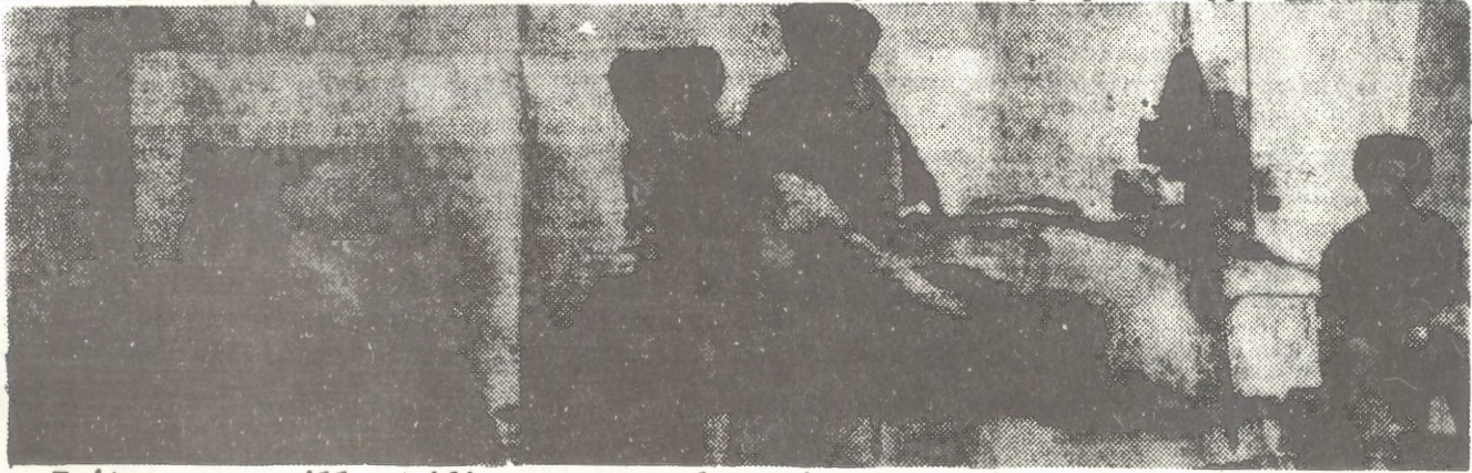
Eritrean guerrillas riding a captured Russian T54 tank on the road to Massawa

Reports from Somalia point out that now a Supreme Strategic Military Command has been established in Ethiopia, which is dominated by high ranking Russian officers and three Cubans. This Supreme Command is intended to co-ordinate an attack to prop up the Ethiopian Military Junta and provide a stable base for the Soviet social imperialists in the area, who have already recently been kicked out of the Sudan and Somalia because of their colonial activities. Such increased aggression by the Soviet Union only serves to expose its true imperialist nature behind its socialist mask, and thus strengthen the peoples' opposition to it.