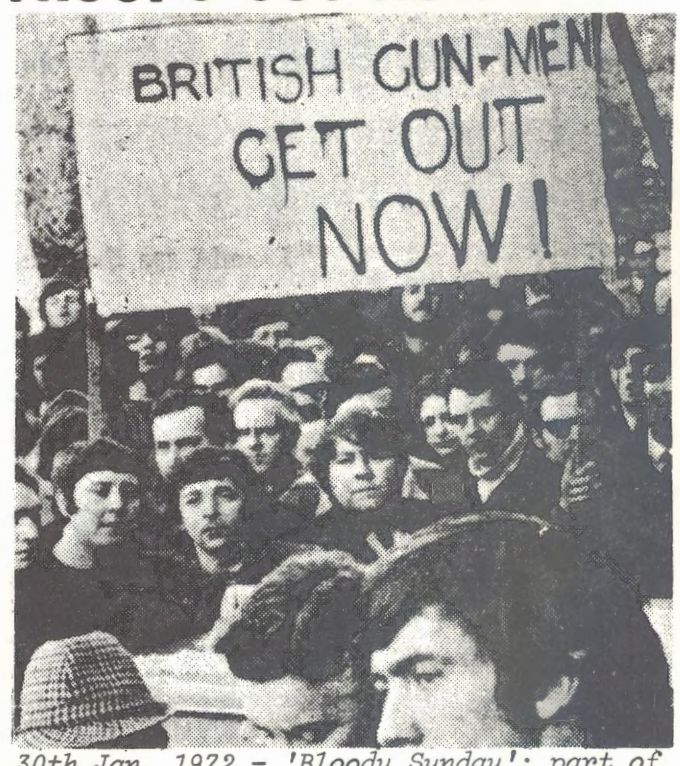
30th Jan. 1972 - 'Bloody Sunday': part of the mass demonstration, just before the imperialist army opened fire.

The Prevention of Terrorism Act removes basic civil liberties. Under it the police have extensive powers of detention and arrest. "Suspects" can be detained for seven days without charges being made. Access to a solicitor is denied. 3,000 people have been detained under the Act since 1974. Only about 5% have ever been charged. Some of these were only for charges arising from the Inland Revenue Act. The police use the Act for gaining information on the activities of republicans, communists and occupation of Northern Ireland. A nation that anti-fascists. This clearly shows that British imperialism's occupation and brutal repression in Northern Ireland is bringing increased reaction to Britain. This means that if the working class is to successfully struggle against oppression and growing fascist reaction