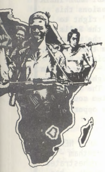
HE RCLB IS DOING

an initial campaign lastill September. The two of the campaign are: