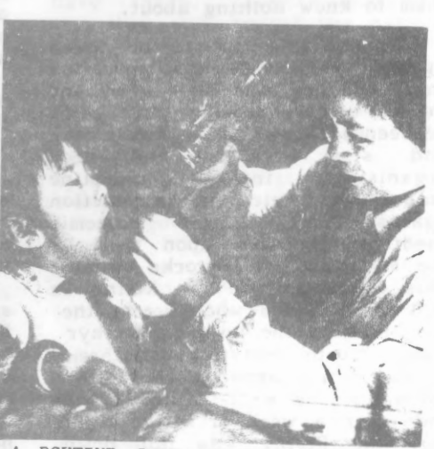
A ROUTINE CHECK UP IN THE NURSERY OF THE BEIJING No. 3 COTTON MILL