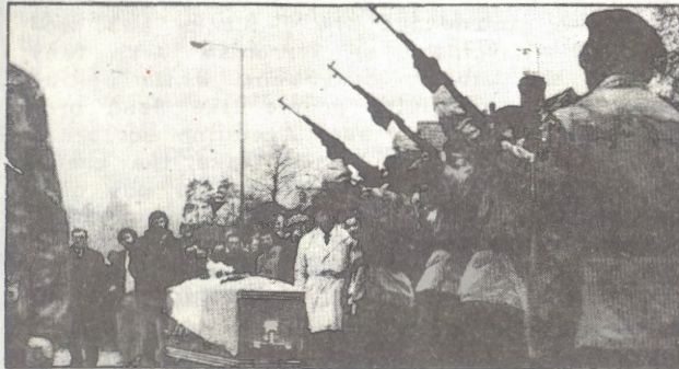
FINAL SALUTE TO BOBBY SANDS

The election of two H-Block prisoners to the southern Irish Dail (Parliament) in the recent elections represents an important step forward for the campaign of the prisoners for political status in the form of the Five Demands. Overall the results of the election have shown once again the growing support for the prison struggle and, in the situation of political deadlock that exists in the south, have enormously increased the influence of H-Block supporters there.