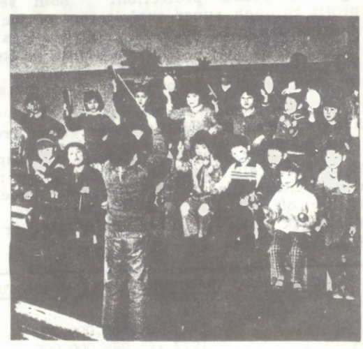
REHEARSAL AT A BEIJING NURSERY

Yet another impressive thing was the importance attached to educational opportunities for workers. Take the example of the Shanghai Heavy Machine Tool Plant again. On the factory site there is what is known as a "Workers' College". Here, workers from the factory come to do a three year full time course, after which they will usually return to their former jobs. They receive full pay whilst studying. To be chosen to come here a worker must apply and then sit an examination and have a physical check up. His or her fellow workers are asked to give their opinions. At the end of the course, students acquire a diplo-