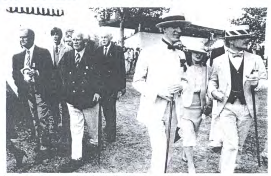
More money than they know what to do with... how they must laugh at the workers they screw for profit every day

The 'VOICE OF THE PEOPLE' brings to its readers the latest information on the salaries of the big capitalist high filers in this country. A year ago 33 company directors receiving salaries totalling more than £3 million. Each received at least £70,000 and the man at the top of the pile, Lord Grade was paid £195,208 Those figures were for 1978-9.