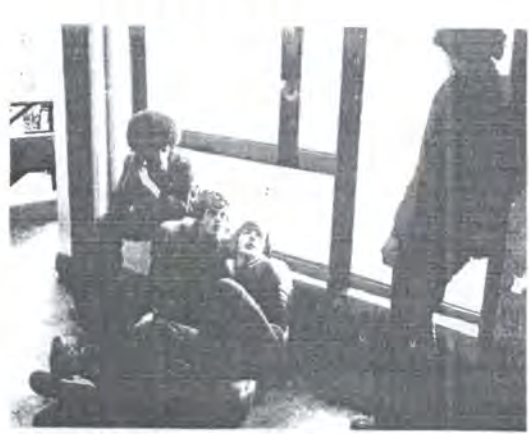
'No hope' kids - hopeless only under capitalism

This state scheme is Her boss paid her nothing obnoxious insult to peoples and she got just the £23.50 weekly government allowance. By all accounts, this was not labour for any boss who can anisolated instance. Last year a exploit a no-hope kid to do third of those on the work menial and dirty chores.