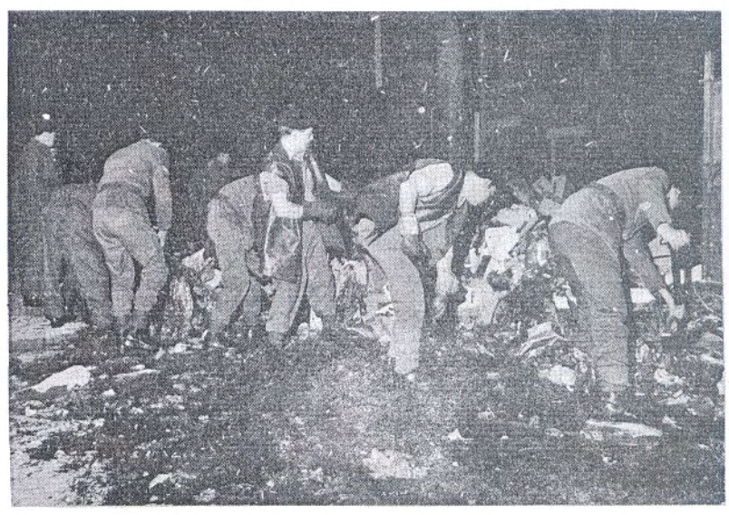
British troops are as much involved in the defence of Britain as the Iranian troops in the defence of Iran. Picture shows British troops strike breaking during the dustmen's strike in 1970.