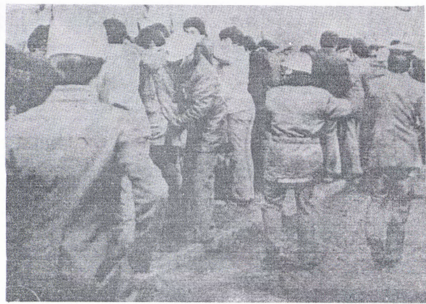
Young Turkish demonstrators being subjected to brutal repression.

The outcome of the unrest in Turkey remains to be seen. In Iran, however, the Shah who prepares to go 'into exile' hopes to repeat 1953 and make a come back by courtesy of the US and Britain, Only fools allow history to repeat itself and the people of Iran are no fools. They will settle for nothing less than a democratic republic whether Carter and Brezhnev like it or not