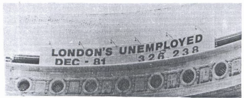
Following a request from the Westminster (TOPS) branch of APEX the GLC has erected this massive illuminated sign on top of County Hall, facing the Palace of Westminster. The sign is a constant reminder of the number of Londoners out of work and will be updated each month. It will remind the Parliamentary gang of the enormity of the crime Thatcher has committed. Others should follow suit.