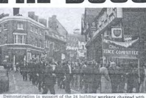
Demonstration in support of the 24 building workers charged with picketing offances.

Once again our class must by united action scorn bourgoois courts and free the 24. The right to picket was won by centuries of struggle. If we lose it now by allowing this show trial to succeed, then strike action in future will be considerably weakened. We workers demand the release of the 24 whether the Government has to resurrect the official Solicitor or the Official Excuse-maker'