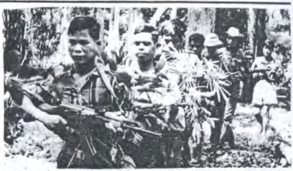
Fighters of a regional unit of the People's National Liberation Armed Forces of Cambodia on the march.

the capital, were fired on by troops but the people fought back. Government buildings were attacked and police stations set alight. This continued for two more days until the Prime Minister and his Deputy, both Field Marshals, were compelled to flee the country. With the USA involved in backing another puppet, Israel . in West Asia, the last thing it wants is further unrest in South East Asia, These are early days yet, but the situation looks ominous for imperialism. In the quiet before the storm, you can almost hear a domino falling.