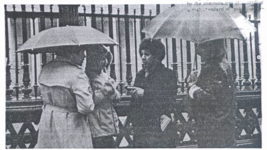
Pickets outside the British Museum explain to tourists why it is closed.

The momentum continues and as workers all over the country get the taste of battle the Government is beset by