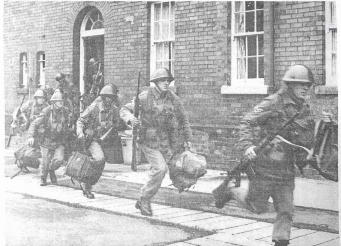
Guard troops leaving a barracks for guard duty 'somewhere in Ulster'