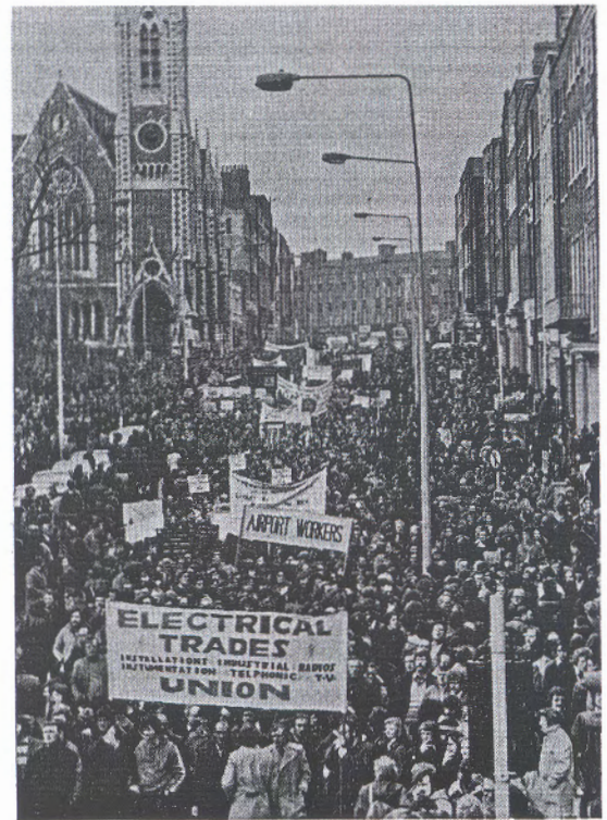
200,000 Irish workers demonstrate in Dublin against the Government's pay and taxation policies. Report