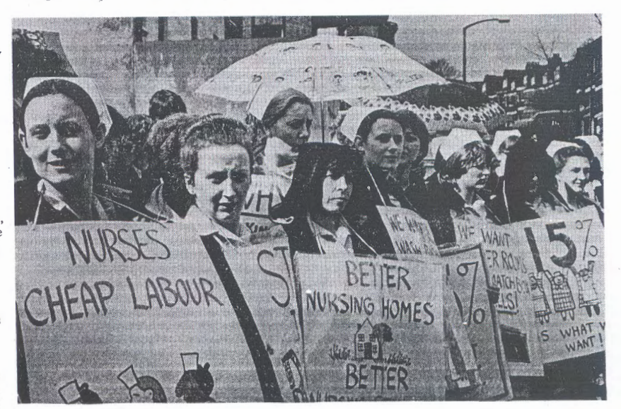
Nurses' demo at Whittington Hospital. Part of the struggle which brought them victory. See story p. 4.

In an 'Election Supplement to be included in THE WORKER No. 16 we shall develop the theme of the alternative to capitalism and now the working class can, at this very time, 'express its choice for it.