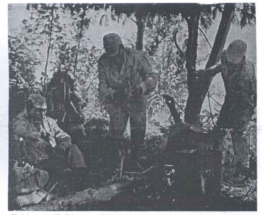
Zimbabwe guerrilla fighters establishing a base in a woodland area for their war of liberation. The Zimbabwe 'leaders' who have betrayed the liberation struggle by associating themselves with Smith's "internal settlement" have also associated themselves with the mass murder of unarmed people when Smith's racist security forces fired on a meeting of Zimbabwe villagers.

fification this year but the government offered-only arbitration and putting the anomaly right by 1980/81. But the AUT threatened to carry out their action throughout the period of arbitration. On 5 May the government offered to pay the full settlement over the next two years, with 12 per cent to be paid this October. The ALT have learned a valuable lesson that the only way to bargain is to threaten direct action. Maybe the government felt they couldn't rely on troops to mark exam papers.