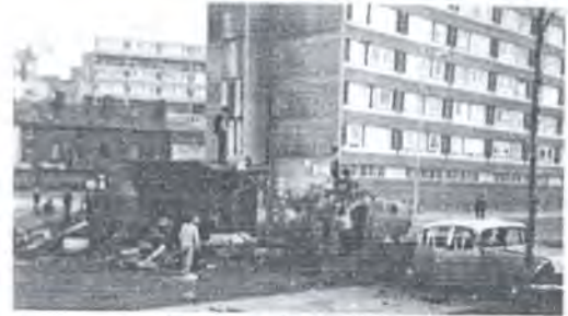
Barricades in Rossville St. Derry