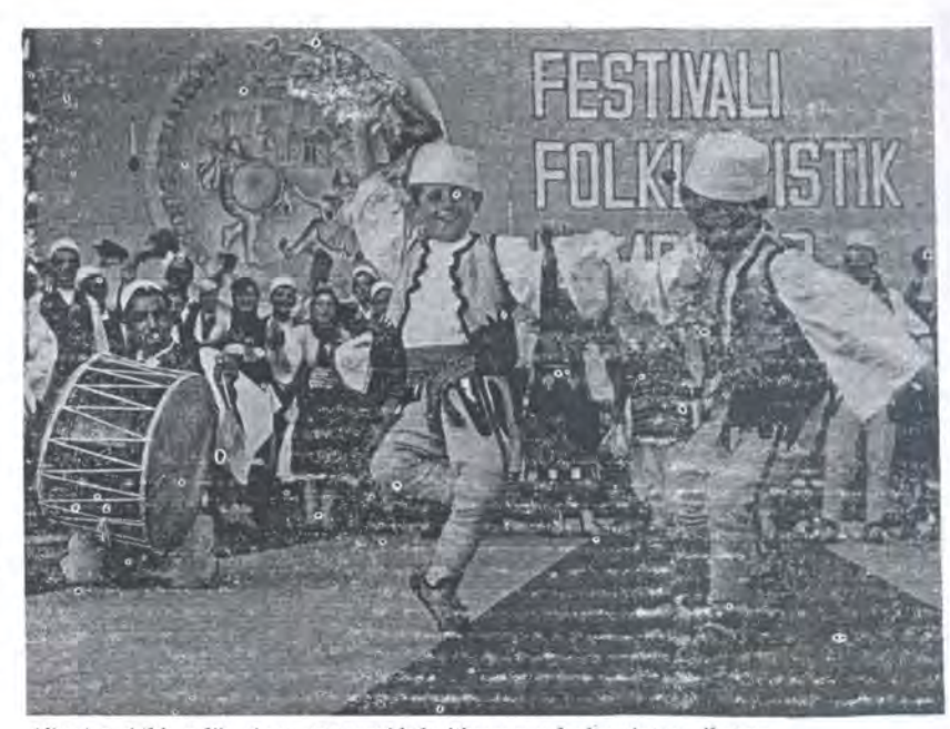
Albanian children like these are provided with care and education at all ages.

The productivity deal is a way of reducing manning levels and increasing flexibility which not only means destroying skills but also, inevitably, unemployment,