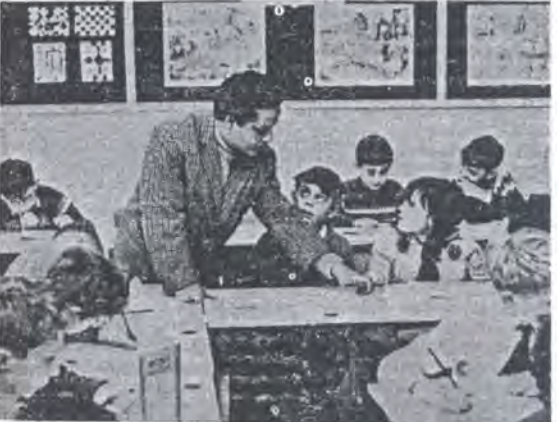
Britain's teachers have traditionally defended their freedom in the classroom.