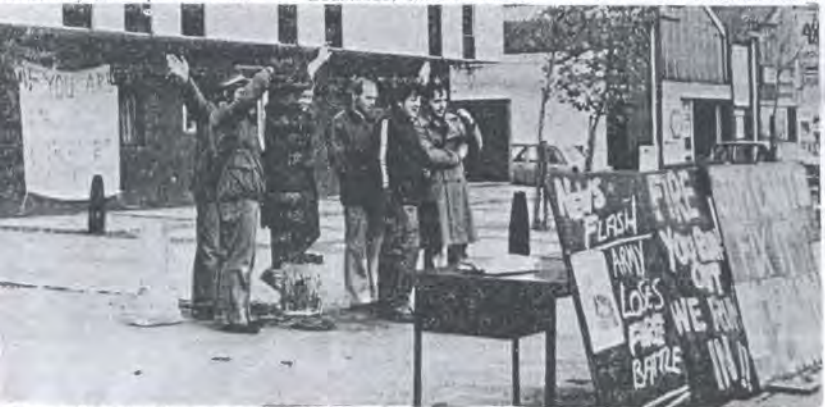
Firemen's picket lines became a familiar sight during their 9-week strike.

The power workers will undoubtedly flex their industrial muscle over their claim for 30 per cent. Overall the trade union movement has learned that no distinction is to be made between Labour and Tory in their class war.