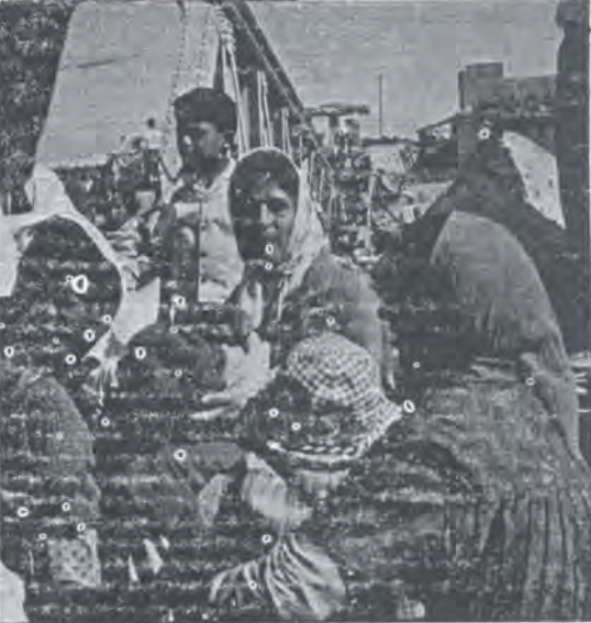
Palestinian refugees driven from their homes on the west bank

Palestine, the promised land has become a land of 'peace missions' - specially so since