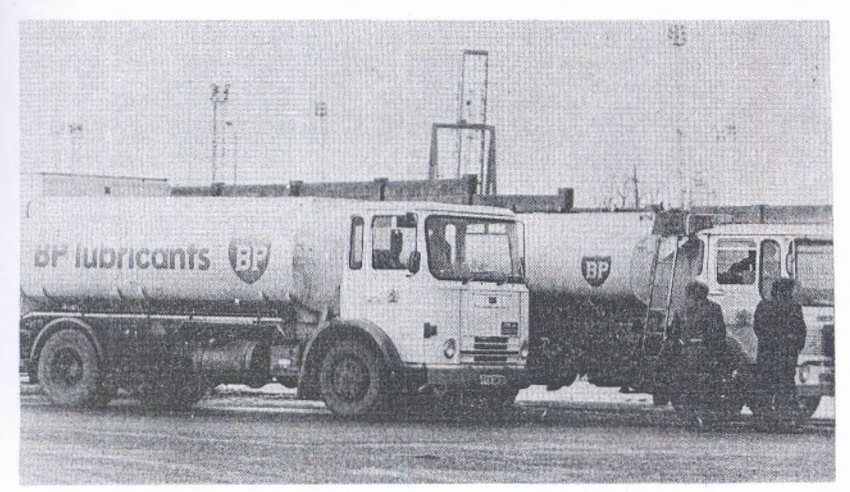
BP tankers stopped by lorry drivers' picket. Some tanker drivers have already joined the strike called by Texaco tanker drivers.

The price of hides has in-creased too, and further tanneries are expected to close. neries have closed and layoffs inflicted in Cumbria, Bolton, and as reported the THE WORKER, in Beverley, where the NEB gave the order for the closure. It is up to the workers and the National Union of Footwear, Leather and Allied Trades (NUFLAT) to take sole responsibility for saving the British footwear and leather industries.