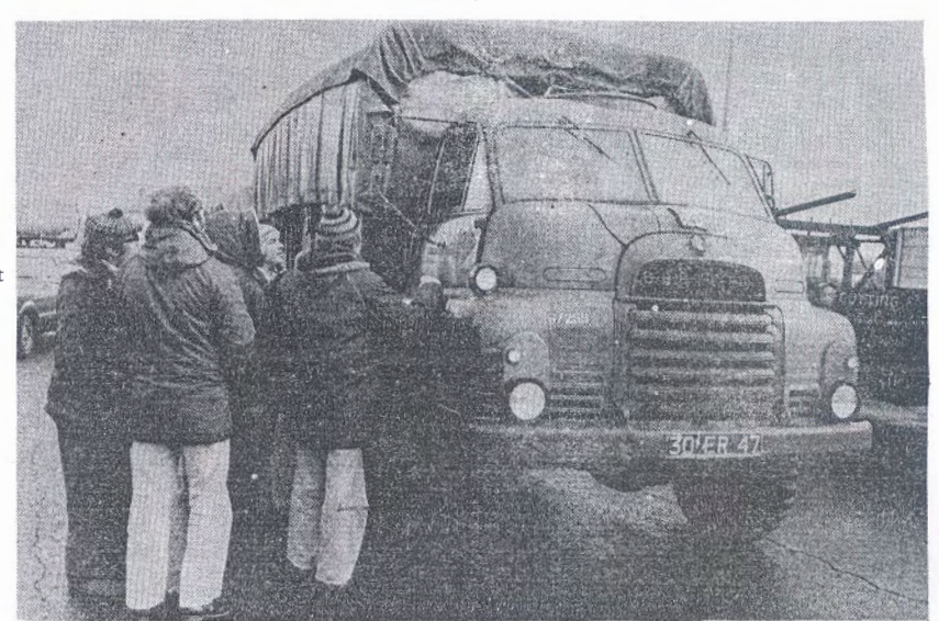
A hint of things to come. This army vehicle drove through a lorry drivers' picket line at Tilbury, Essex.

As the Government's antiworking class pay policy crumbles on every front, private and public, Government spokesmen threaten to introduce other means to safeguard profits - punitive taxation and swingeing cuts in public service. The Home Secretary warned in connection with the latest industrial action that the Government "would not sit back" while their capitalist policies were defeated.