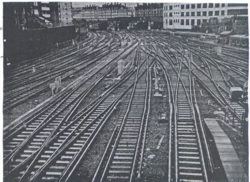
Victoria Station last week during the ASLEF strike.