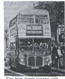
For how much longer will London's buses be running?

The more sensible capitalist countries recognise this. After the GLC's fare reduction, fares would have covered 54 per cent of London Transport's costs. This compares with 39 per cent for Berlin, 44 per cent for Paris, 25 per cent for Rotterdam, 33 per cent for Barcelona, and 55 per cent for N York. The subsidies actually represent the payments by the community and the state for an enormously important service. The true cest of pursuing so-called 'economic' break-even' policies