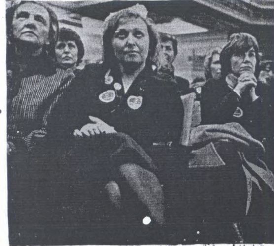
Inchberg of the Reval College of Nursing meeting before lobbying

Yet those who do the ouring and see the deterioration as a result of government policy know the opposite is true. A poorly