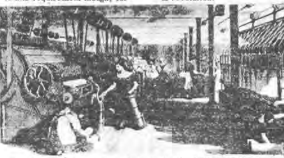
Heyday of the Industrial Revolution in the North West. A Manchester

All workers in other industries must seek to learn from these examples, not least the construction workers whose weapons for struggle against the Social Contract were wrenched from their grasp. In this corner of the country alone we have the skills to generate enough electrical power to supply the whole world, resources sufficient to restore and re-equip the entire railway and underground railway systems of Britain, and the technology which could defend the nation from any form of external military attack - nuclear or otherwise. History has imbued us with a sense of proletarian discipline that is among the most extensive and intensive in the land, and we have a further advantage of knowing that capitalism is so corrupt that it would destroy all these assets in order to retain political power. It is only fitting then that we should now use our intelligence to grasp the immense potential that we have created of ourselves, and the one future that capitalism's logic has brought us to - the inevitability of revolution