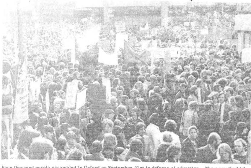
Four thousand people assembled in Oxford on September 21st in defence of education. The council which was discussing its education budget on the day was forced to defer its decision.

achievements of agriculture in China was the topic chosen by the second speaker In that land where hunger and starvation reigned before liberation, now the Chinese people can feed all their population of 800 million because they themselves are in control of their own affairs. He described the countryside as being full of people, busy gathering in the rice harvest and planting the new crop, and his impression of the people themselves - serene and dignified. confident in the knowledge that they are relying on their own efforts and achieving what would have been impossible without socialism The delegation had visited homes of agricultural brigade members, finding a re-laxed and friendly atmosphere, in spite of the hard work being