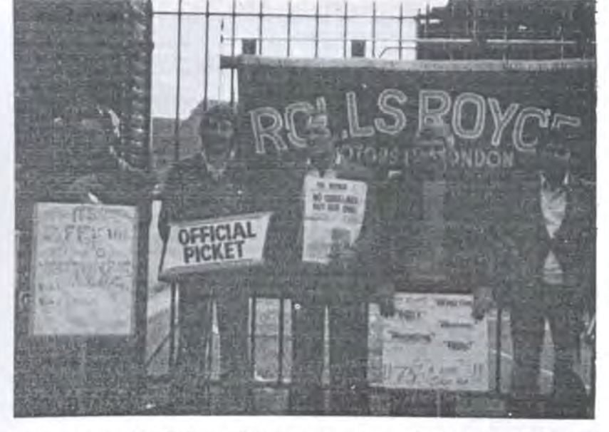
Pickets on duty outside Rolls Royce, Willesden, In North London. The strike for a 17.6 per cent wage rise and a new bonus scheme and improved holiday and sick pay is now in its sixth week.

forms the heart of manufacturing, Similarly, the destruction of apprenticeships and proper craft training for youth graphically demonstrate that no long term recovery is planned for Britain.