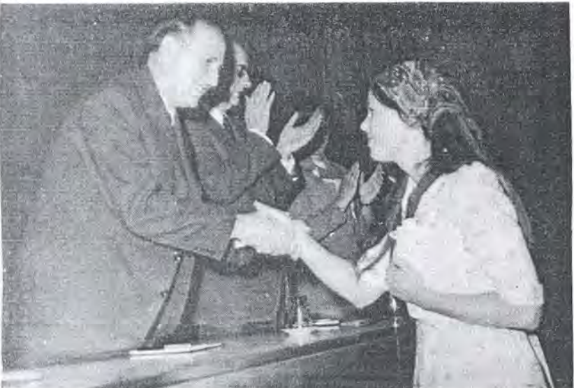
Ramiz Alia, member of Political Bureau, greets CPB(ML) delegate.

This Congress has given them a tremendous impetus to continue the building of socialism, in creating the 'new socialist man' and upholding the principles of Marxism-Leninism.