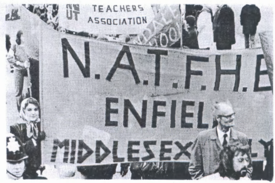
NATFHE members in action last year against education cuts.

The conference went on to register its opposition to any interference in collective bargaining calling for a substantial increase in the salary of all grades.