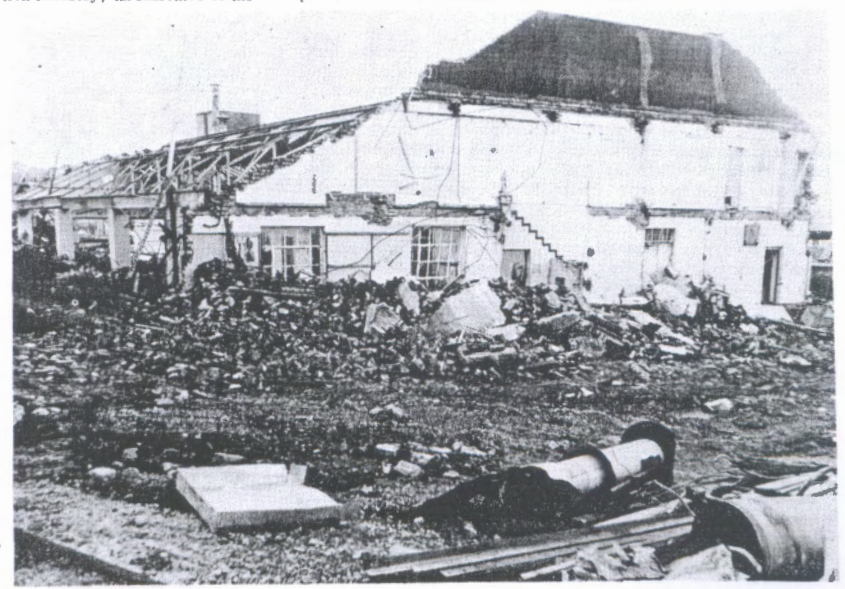
Capitalist vandalism in action: Ashley Ilill bakery, Bristol, gutted for profit.

The lesson is clear. Student Unions should not implement education cuts by accepting the alternative use of colleges. They should present a common front against their common enemy.