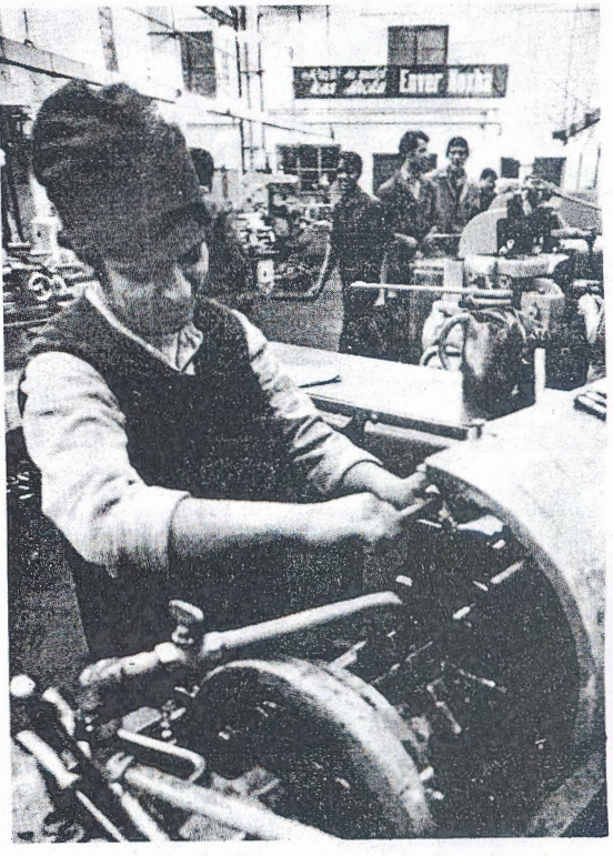
Women play a major part in the building of socialist Albania

Despite its fast growing population which means an ever expanding workforce Albania does not suffer the evils of unemployment. Nor are the improved living standards solely a feature of the developing industrialised areas. Socialist planning has ensured that not only has the economy expanded on all fronts to absorb the growing work force but that there has been an even development of both agriculture and industry. Albania has thus avoided the mistake which other industrialising countries have made in allowing a massive exodus from rural to urban areas with an accompanying decline in the agricultural sector. Thus the population is evenly distributed throughout the country and standards of living together with