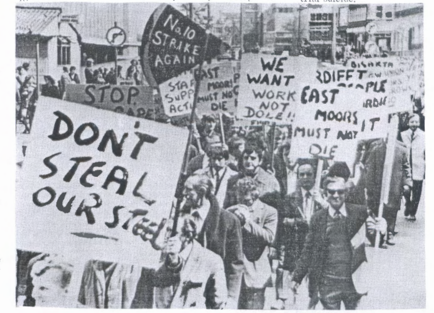
Cardiff steel workers protesting against the destruction of their industry.

Three missions from Britain are visiting China in the autumn at the invitation of the Chinese Ministry of Metallurgy to see if Britain's experience of 'modernising its steel industry' can be sold to China! This opens up a whole new field for British exports. Being the oldest capitalist country and the one, therefore, where capitalism's tendency to destroy its own productive base in an attempt to destroy workers' organisation is most advanced, Britain can now offer to sell abroad its prescription for the quickest and most efficient way to commit industrial suicide