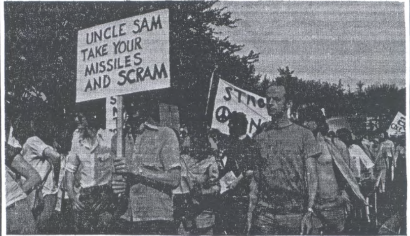
Nearly 2, 000 workers march against Cruise missiles in Oxfordshire.

With US TV stations eager to televise the games, one wonders wherein the success of the boycott for Thatcher and Carter lies