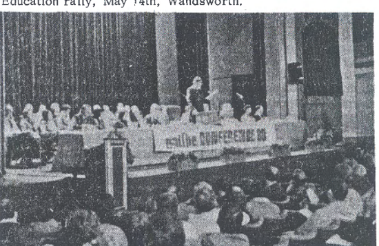
NATFHE President stressing the need to fight cuts and maintain world peace. The full report on the Conference will be published next week.