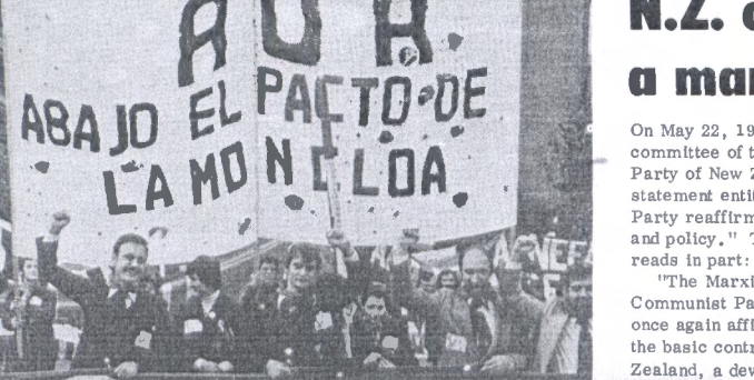
Spanish Marxist-Leninists leading the struggle against the 'Social Contract', Spanish-style. The picture was taken at the 500,000 strong May Day demonstration in Madrid this year. Red flags mingled with the flags of the republic.