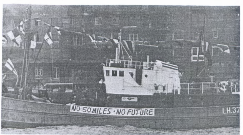
Fishermen's demonstration in London last year. Only the determination of British workers can ensure the future of a fishing industry. (Photo Nick Birch ).

This chronicle of stupidity is our own doing; we should never have said yes to such a cartel of capitalists who