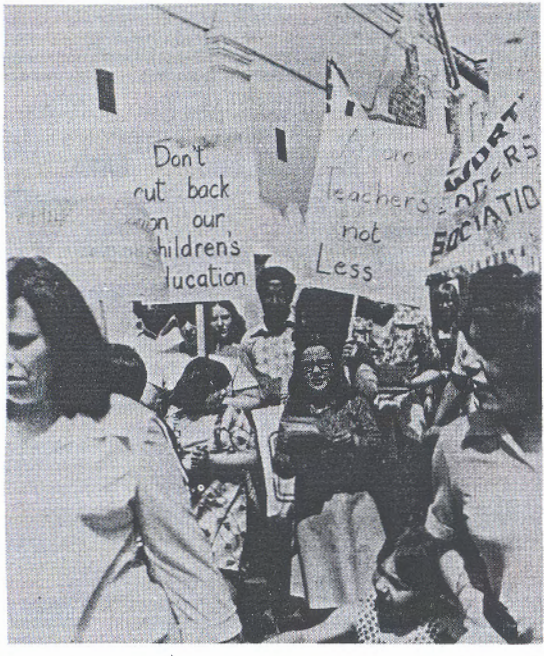
More teachers, smaller classes and no closures.

If we allow amalgamations and closure now we will be faced with overcrowded schools and inadequate resources in the 1990s. Amalgamations take six to eight years to complete, by which time the school population will be beginning to rise again, requiring a similar long period of disruption. That is if it is ever intended to re-expand the schools to cope with the expanding numbers! It has been calculated that it would be less expensive to maintain all resources over the period than to cut resources now and expand later, Most probably the authorities are very well aware that falling rolls are a transient phenomenon, but intend to use them fully to slash back educational provision.