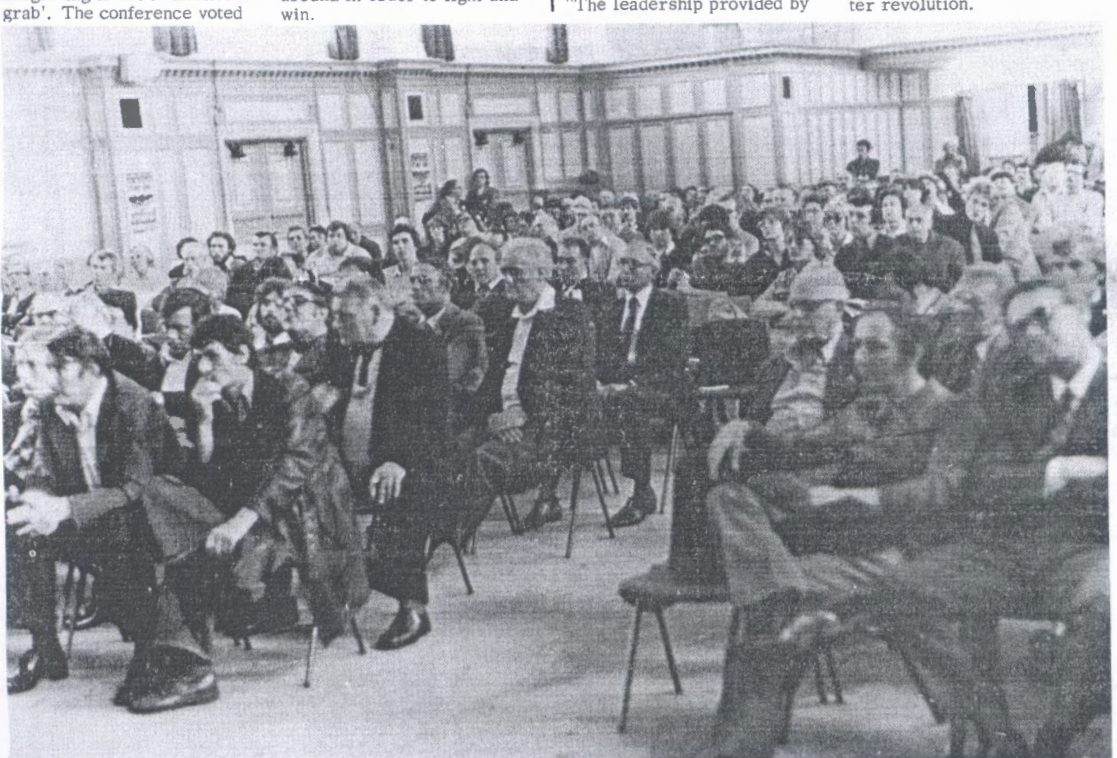
Meeting of dockers at East Ham Town Hall on June 28th against the closure of London Docks.

"In fighting, both on the plains and in the mountains, man is the decisive factor that determines the fate of the battle, regardless of the development of armaments. A smaller army can defeat a greater army, superior in manpower and means, when this small army wages a just war and when all those comprising it are politically clear about the just nature of the war they are waging, indissolubly united in their determination to achieve victory over the enemy, resolved to the end to shed their blood to the last drop for this purpose; and well trained to overcome all the difficulties of the war. In the field of battle man can replace the weapon, but the weapon can never eliminate the role of man: without man a weapon is nothing but a dead piece of iron, lifeless and powerless."