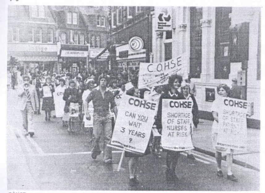
COHSE workers on the march to protest against the shortage of staff and the running down of the NHS