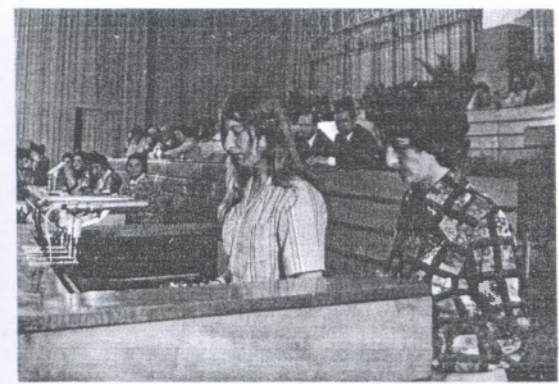
CPB(ML) delegate to the Congress of the Albanian Women's Union addresses the meeting.

This Trades Union Council opposes any Phase 4 of wages policy and opposes all restrictions in any form on collective bargaining by any government.